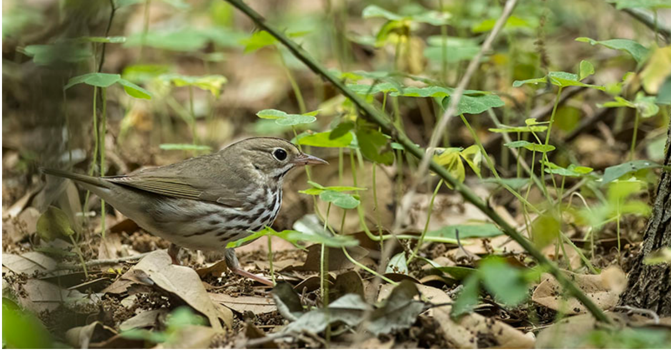
Ovenbird, a thrush-like warbler, in a migrant trap woodlot.