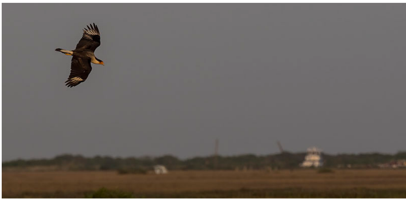
Crested Caracara over the coastal prairie.