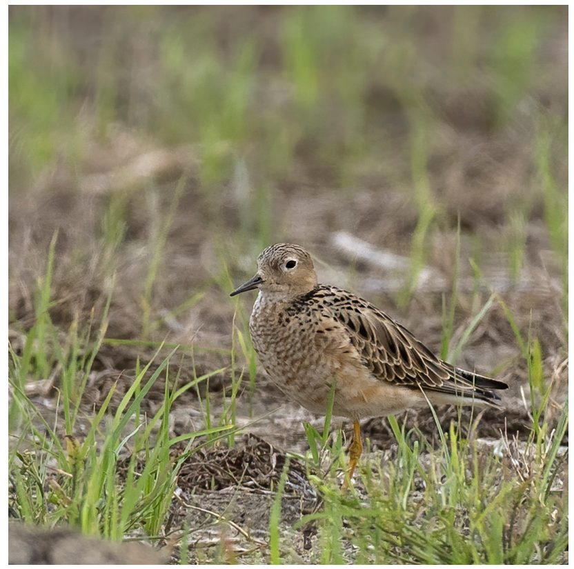
We saw loads of freshwater-loving shorebirds, including remarkable numbers of Buff-breasted Sandpipers.

As expected, migration was in full swing for this tour. When people think of bird migration, they tend to default to landbirds, but my favorite migration spectacles in Texas actually involve waterbirds. As usual, there were huge numbers and excellent diversity of saltwater-loving shorebirds, terns, and gulls. And as always, the Houston Audubon Bolivar Flats Sanctuary was a delightful spot to visit, a real gem of a place that offers worldclass photography. birding and Rollover Pass was also good, despite the closing of the channel to the Gulf in the last couple of years. Inland, the