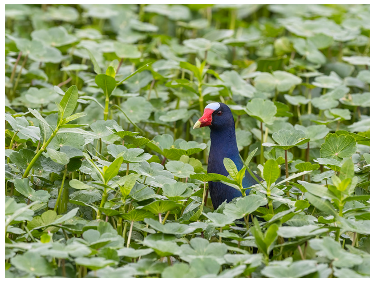
Purple Gallinule is always a favorite bird on the Upper Texas Coast. Such rich colors!

Marsh in Beaumont. Highlights in this habitat included Glossy Ibis (plus a classic hybrid with the common White-faced Ibis), Least Bittern, Sedge Wren, Purple Gallinule, and Sora. Driving through the suburbs of Beaumont, I kept a sharp eye out for crows, hoping to add Fish Crow to the trip list. I eventually found a rather tame crow in a half-derelict strip mall parking lot. Though it looked good for Fish, you want to hear the call to be completely sure. But this bird refused to call! After a frustrating 10 minutes, though, it finally gave in, flew up to an electric wire, and gave several diagnostic, nasal Fish Crow calls!