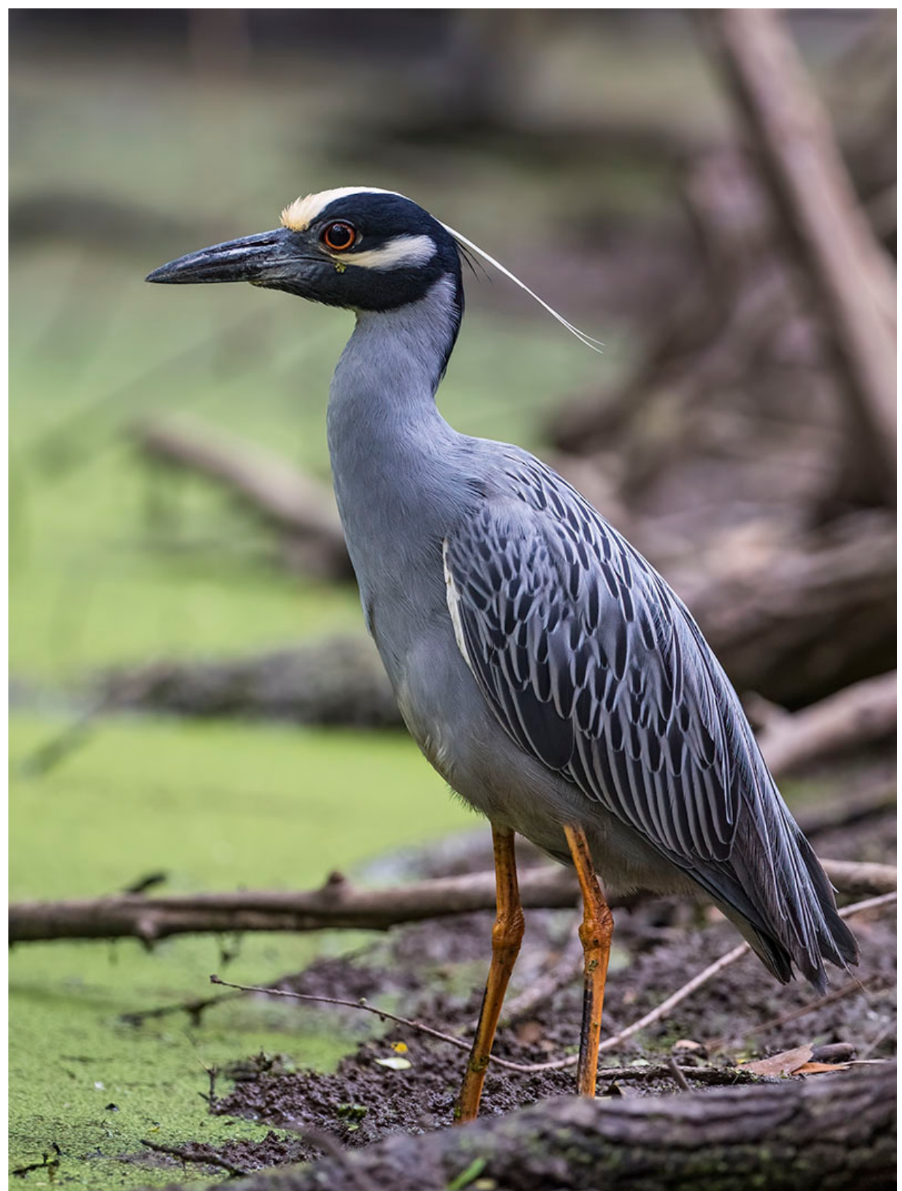
Yellow-crowned Night-Heron is the "default" night-heron; common along the coast.