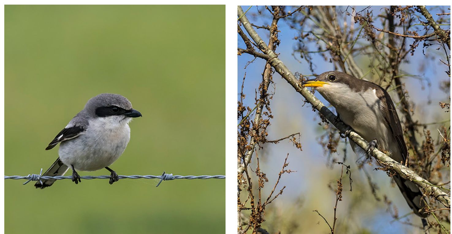
Resident Loggerhead Shrike (left) and long-distance migrant Yellow-billed Cuckoo (right).

Purple Martins were all over the place, including nesting conspicuously in a martin house at Cattail Marsh.