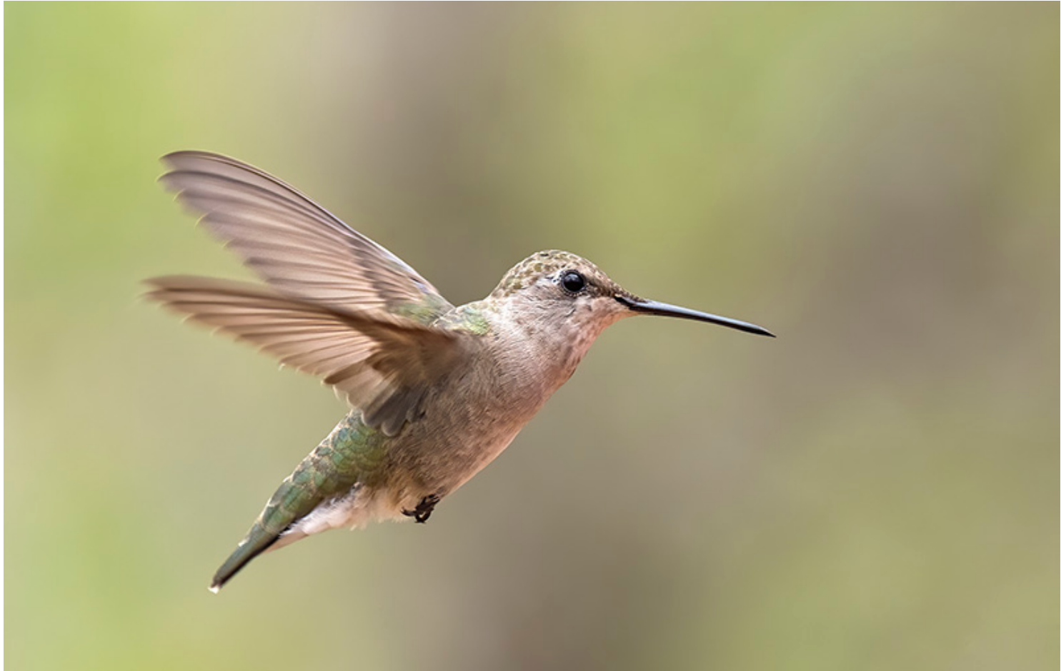
Black-chinned Hummingbird is the common "hummer" in the Hill Country.