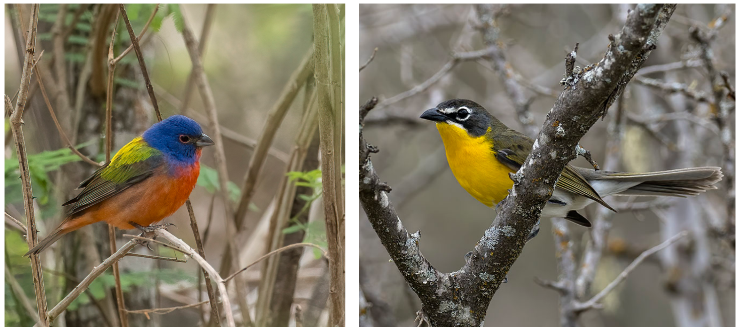
No absence of colorful birds in the Hill Country! Painted Bunting (left) and Yellow-breasted Chat (right).