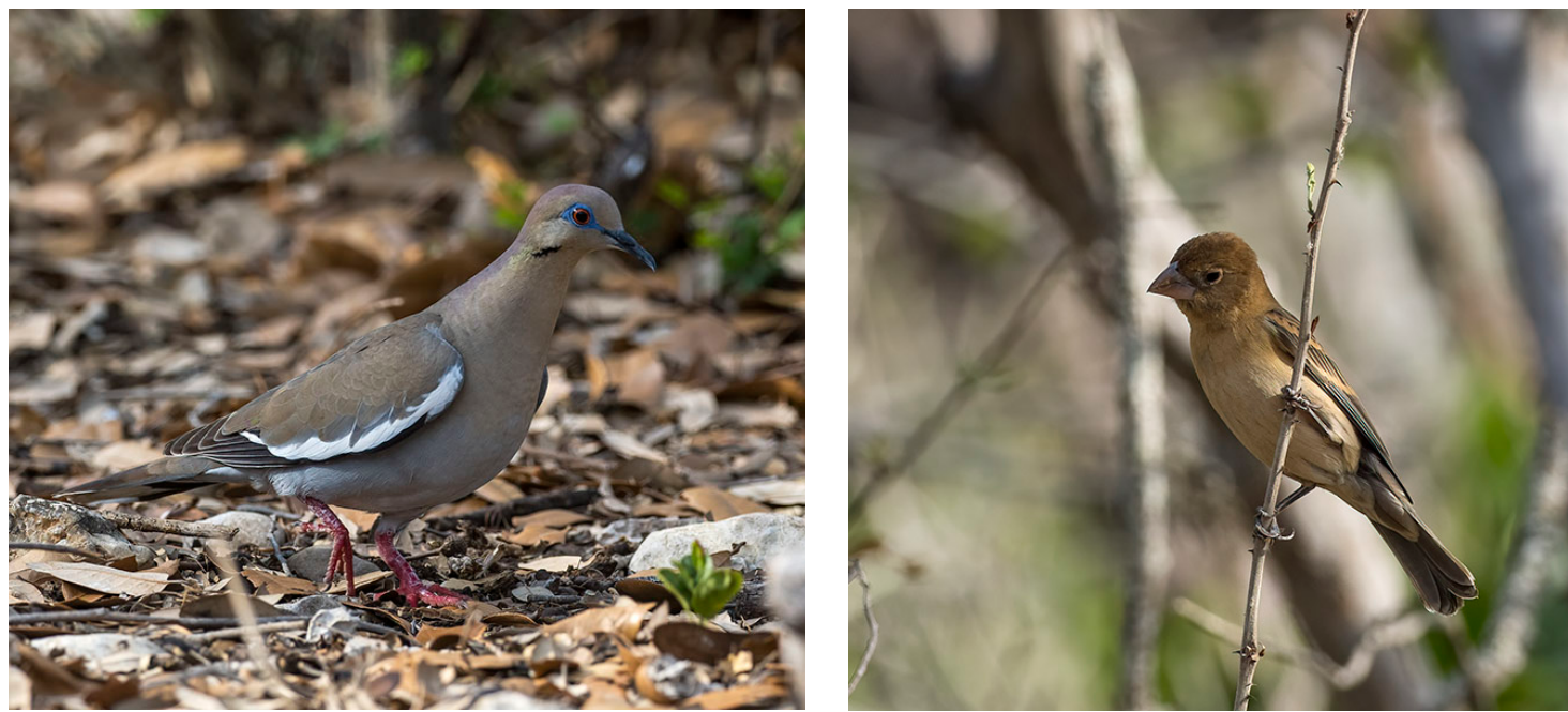
The excellent feeders at Neal's Lodges attracted White-winged Dove (left) and Blue Grosbeak (right).