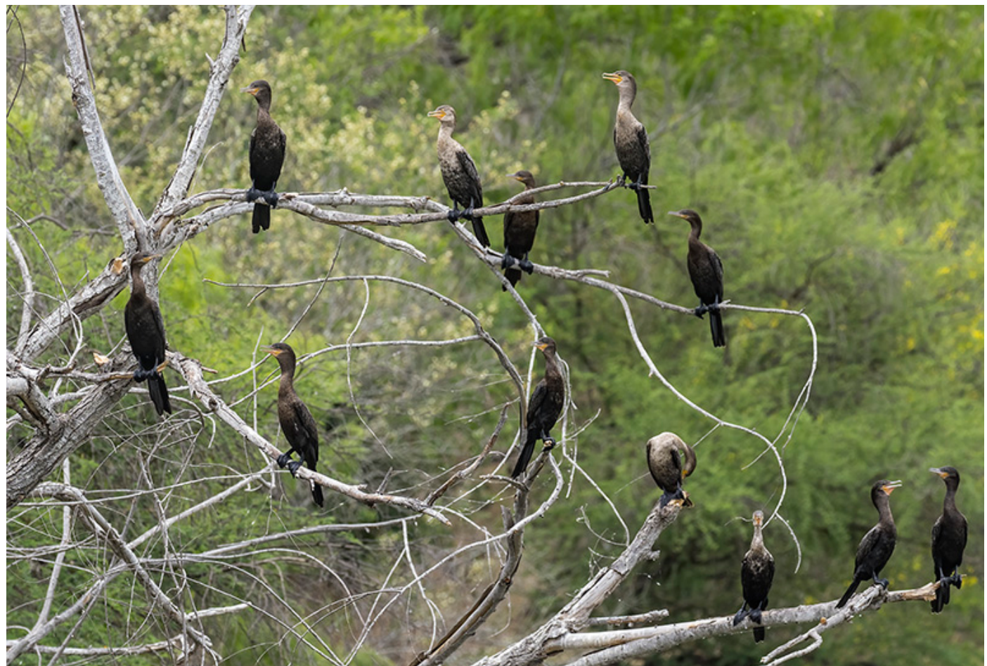
A stop at a pond on the way to the Hill Country didn't hold a lot of birds, but did feature a whole bunch of Neotropic Cormorants!