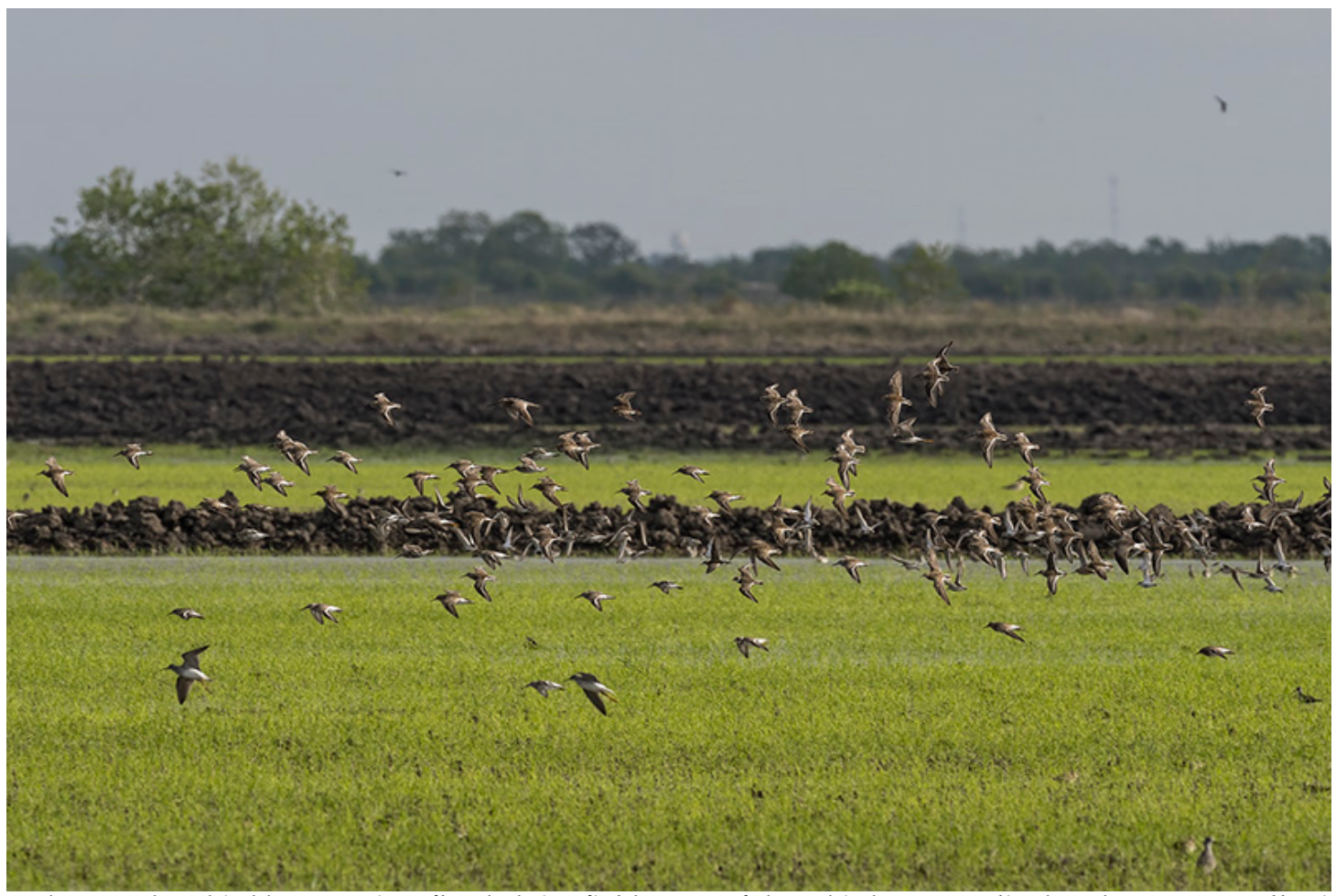
Freshwater shorebird bonanza in a flooded rice field! Most of these birds are Dunlin, but there are actually six different shorebird species in this picture!