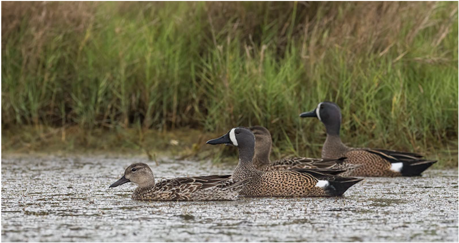
Ducks were thin on the ground this year, which apparently was the case throughout the winter, but there were still plenty of Blue-winged Teal to be seen.