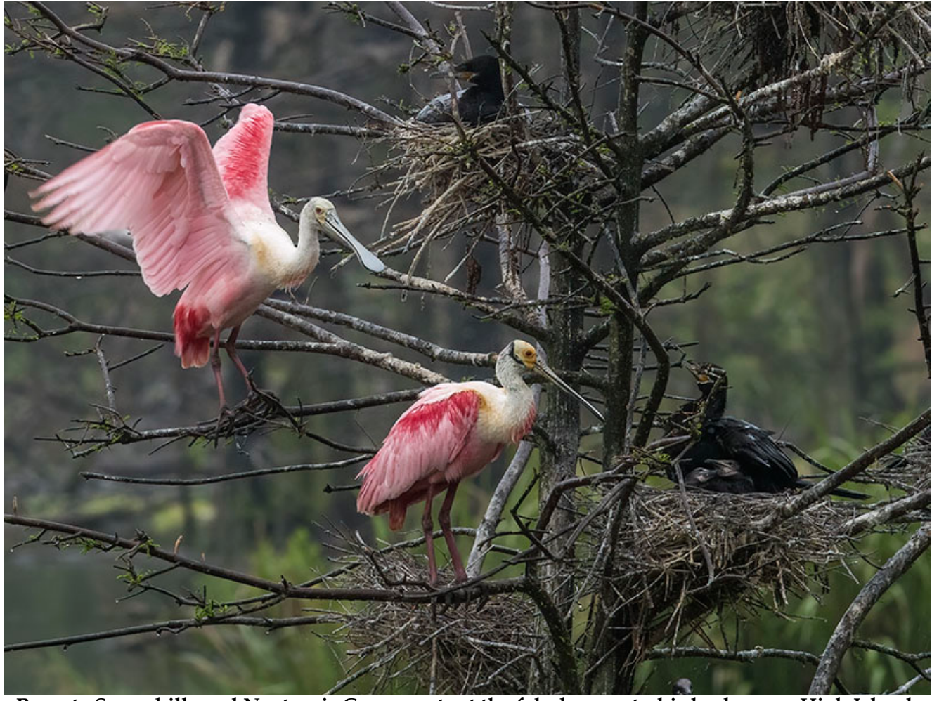
Roseate Spoonbills and Neotropic Cormorants at the fabulous waterbird colony on High Island.