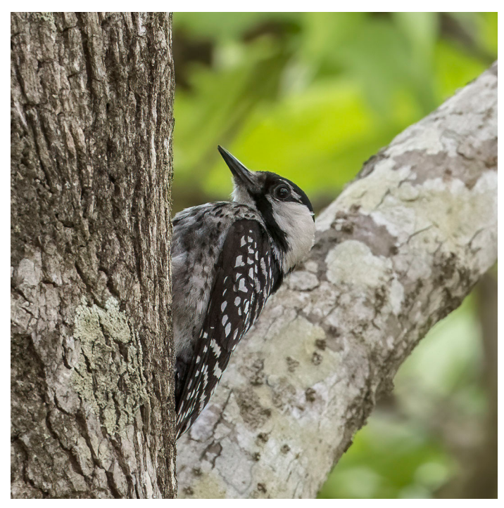
Red-cockaded Woodpecker is a specialty of oldgrowth pine forest.

the highway. Everyone piled out of the van for good flight views of the Whooping Cranes, then we