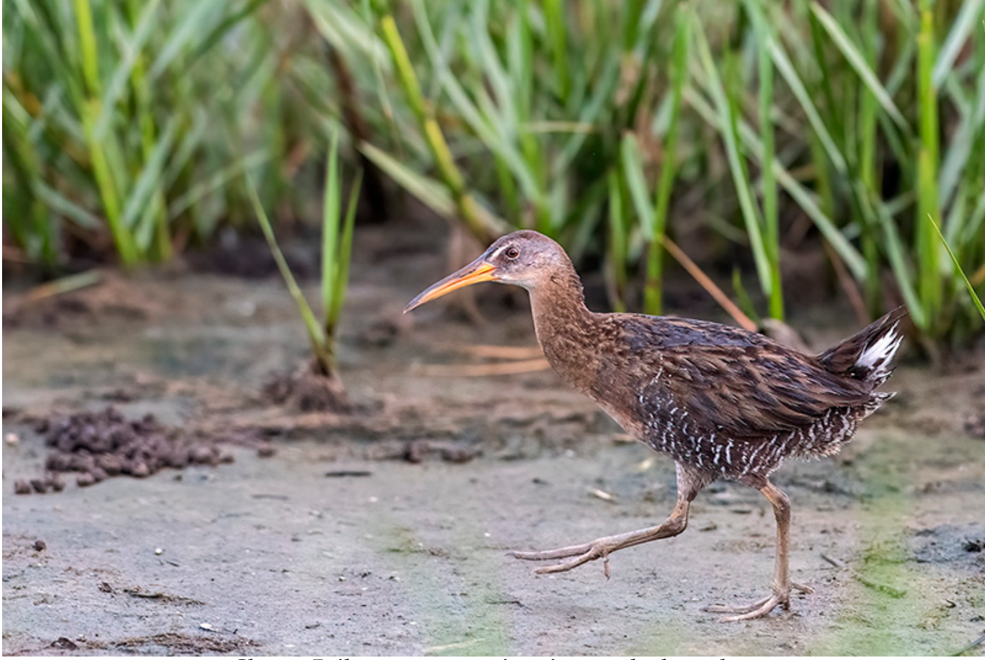
Clapper Rails gave us great views in coastal saltmarshes.