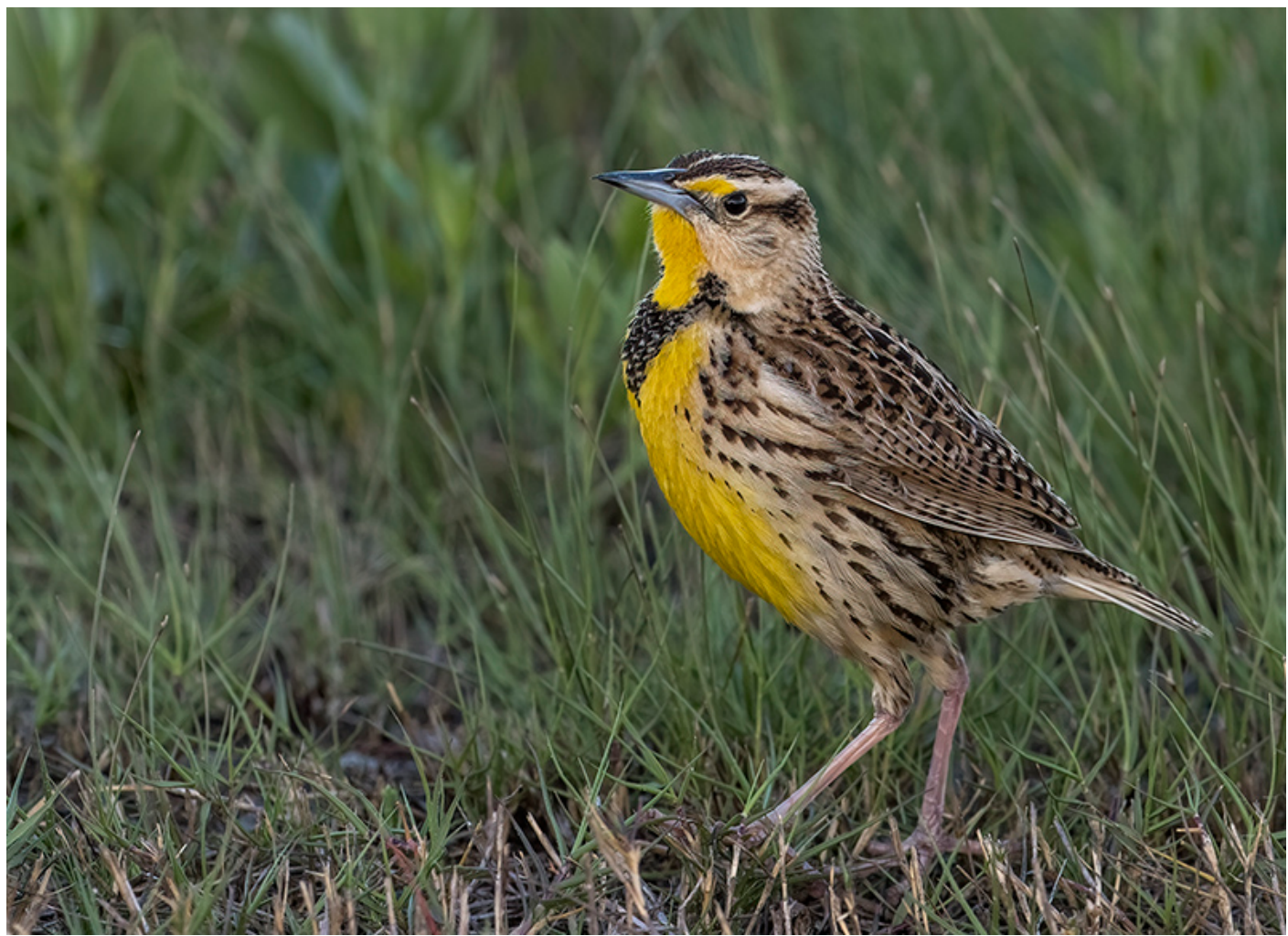
Eastern Meadowlarks were in song throughout the coastal prairies.