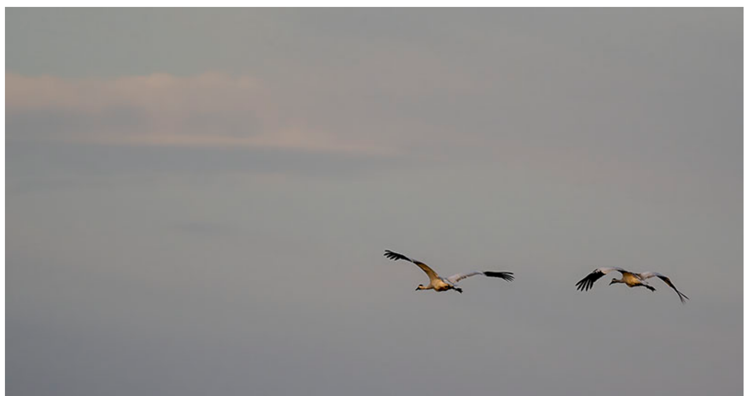
A pair of towering Whooping Cranes were a wonderful sighting near our coastal base in Winnie.