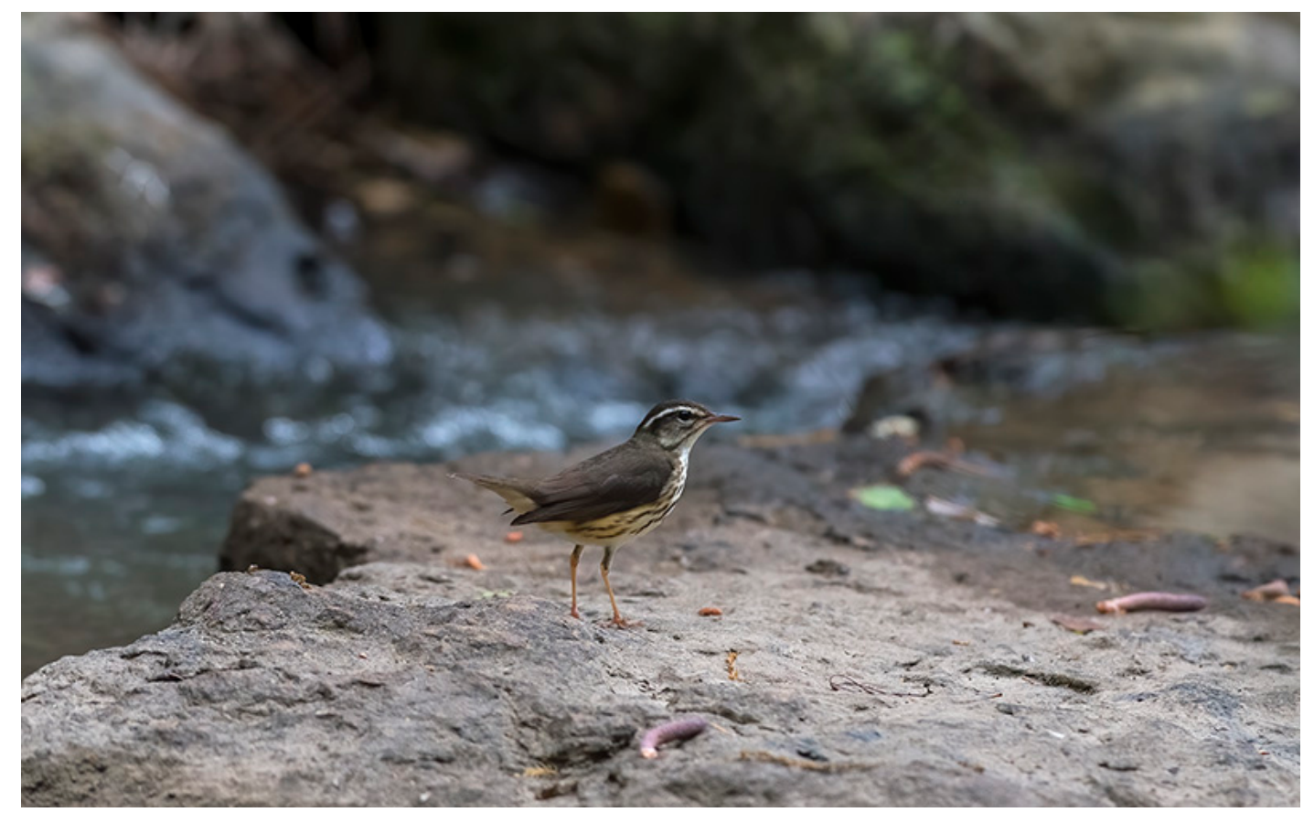
A Louisiana Waterthrush at Boiken Springs, in the Pineywoods.

pine woods (as the name suggests!), along with broadleaf forest and primeval-looking swamp. This lush mix of habitats supports a great suite of breeding birds. Unlike on the coast, you can predictably find a bunch of warblers here, not subject to the vagaries of migration! To mention just a few highlights of our 24 hours in the Jasper area, we saw Swallow-tailed and Mississippi Kites, Red-cockaded Woodpecker, Bachman's Sparrow, Brown-headed Nuthatch, Louisiana Waterthrush, and Yellow-throated, Swainson's, and Prairie Warblers. We enjoyed perhaps the best meal of the trip at a local barbeque joint with family photos all over the walls. Unforgettable melt-in-your-mouth brisket! After dinner we ventured back into the woods, and had an intimate encounter with a hefty Chuck-will's-widow!