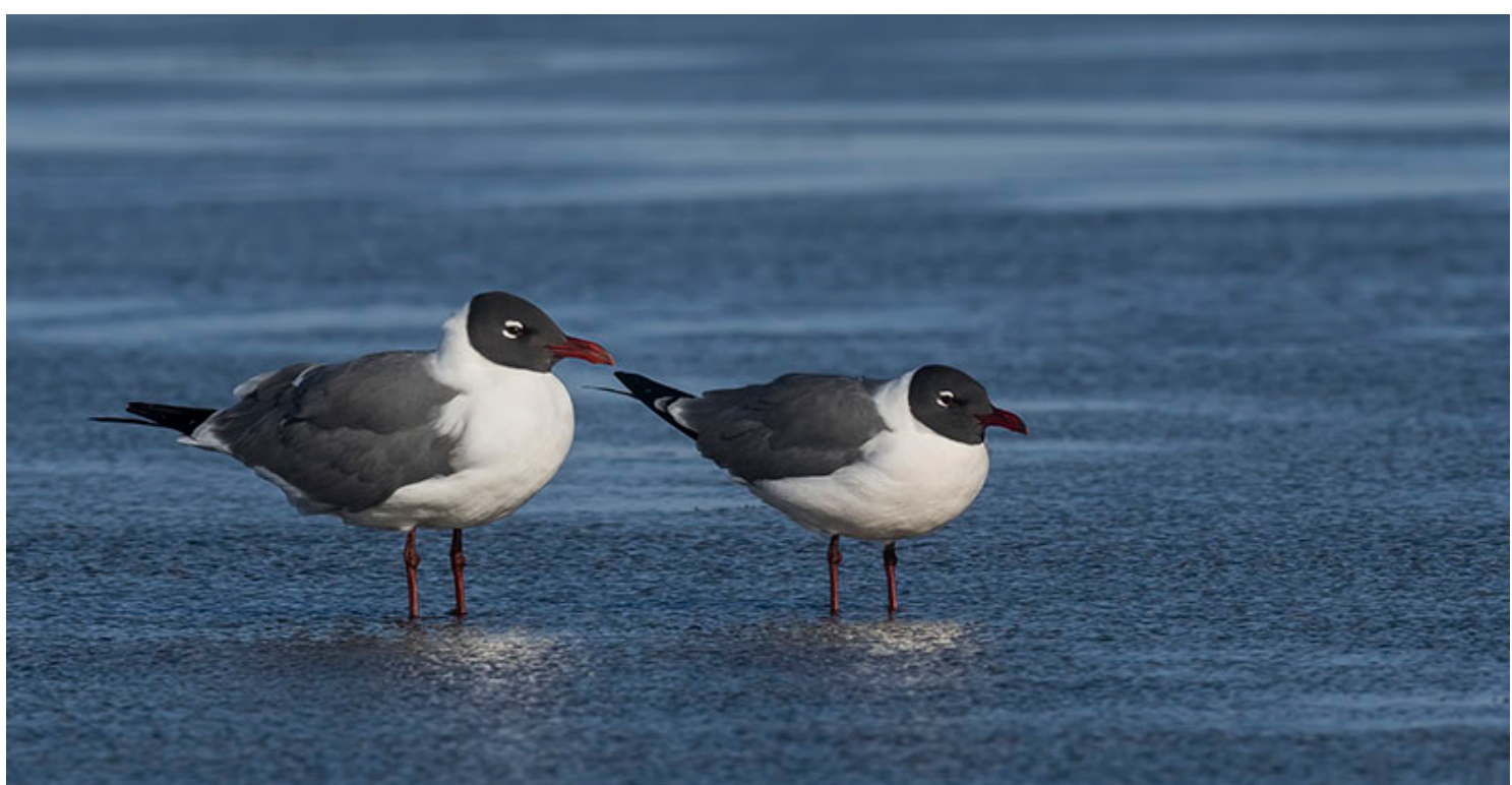
Laughing Gull is one of the most common coastal birds, and a beauty to boot!