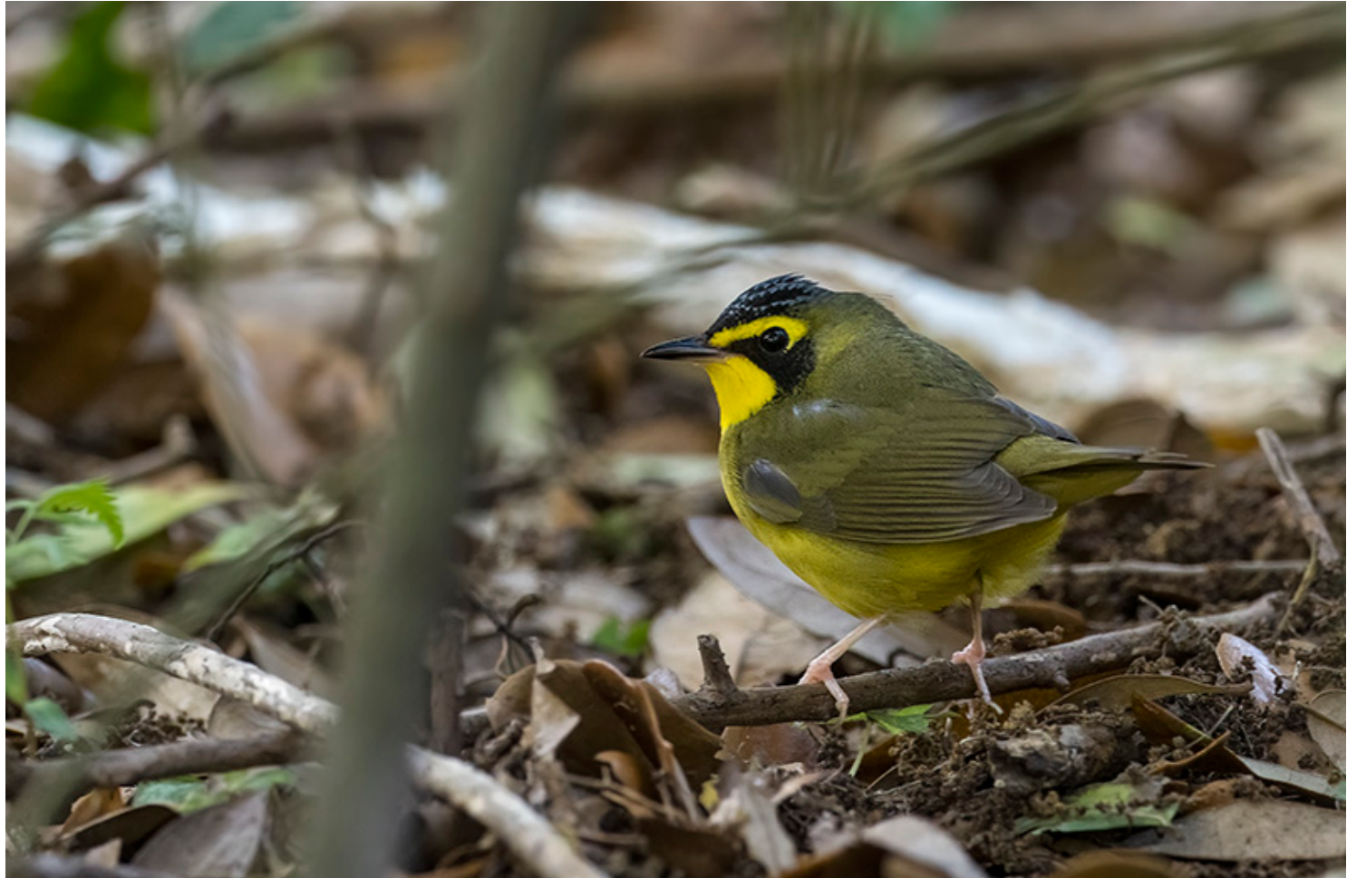
There were migrant Kentucky Warblers in the coastal woodlots, as well as breeding birds in the Pineywoods.