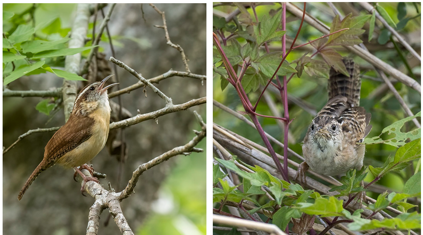
This tour features remarkable diversity in many groups of birds. Warblers are a classic example, but there are also a bunch of cool wrens! Shown here are Carolina (top left) Sedge (top right) and Canyon (below).