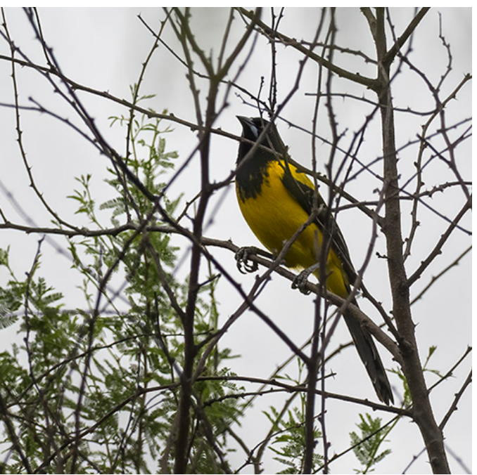
The Uvalde area has a very Mexican-feeling group of birds, including Bronzed Cowbird (left) and Audubon's Oriole (right).