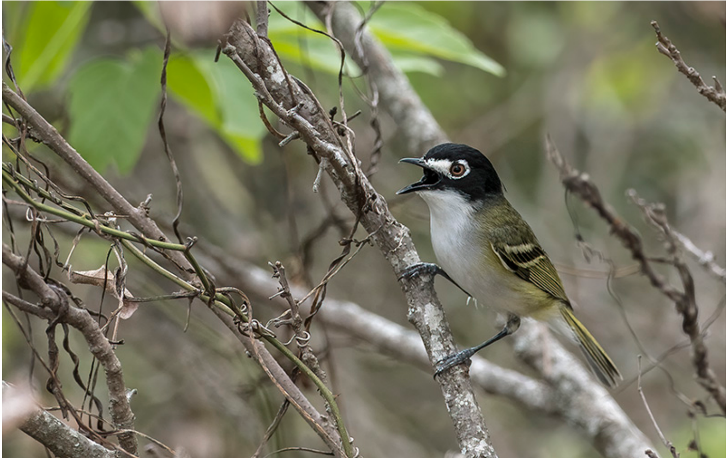
Another group with excellent diversity on this tour is vireos. This is especially true in the Hill Country, with its mix of eastern and western species. Shown here are Black-capped (above), Yellow-throated (below left) and White-eyed (below right) Vireos.