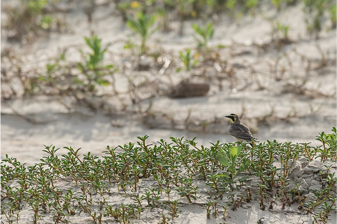
Horned Larks breed on the sand dunes at the Bolivar Flats Sanctuary.