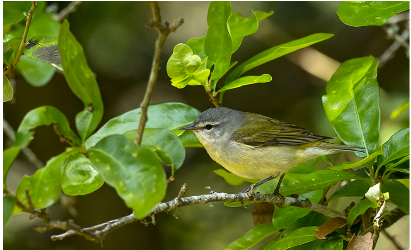
Tennessee Warbler in Sabine Woods.