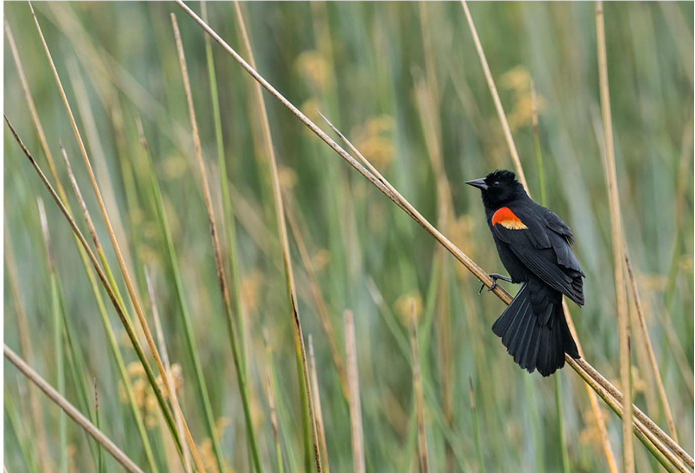
Red-winged Blackbird, a common denizen of fresh marshes.