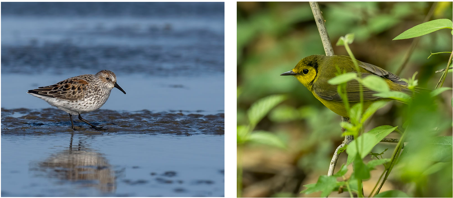
Migrants galore: Western Sandpiper (left) and female Hooded Warbler (right).