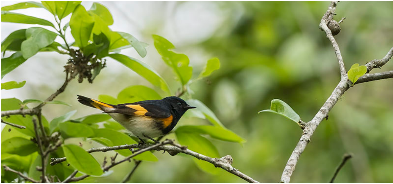
American Redstart is one of the more common migrant warblers.