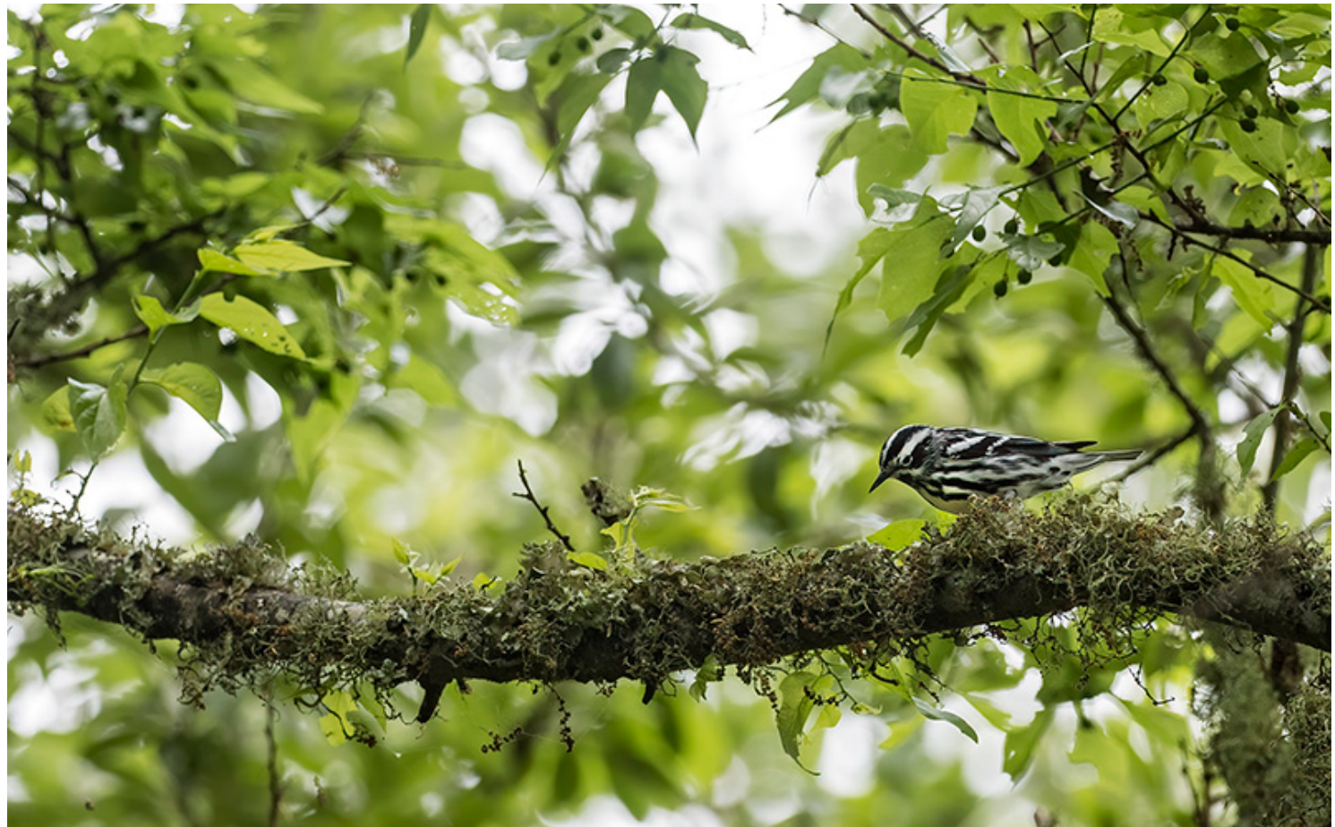
Black-and-white Warbler creeping along a branch in typical nuthatch-like feeding style.