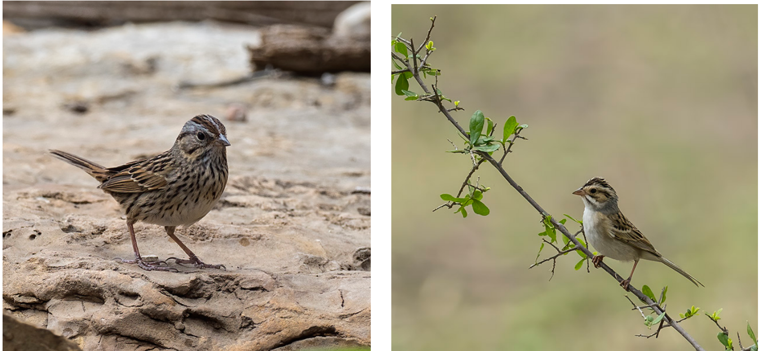
The Hill Country is rich in sparrows. These included migrants like Lincoln's (left) and Clay-colored (right), as well as the resident Olive Sparrow (below).