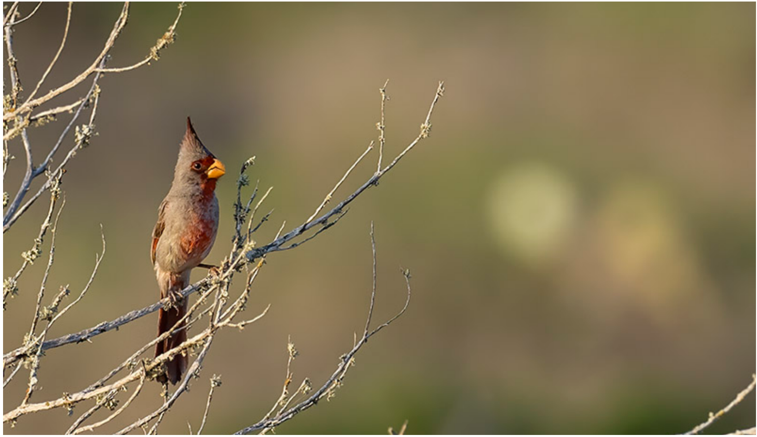
Pyrrhuloxia is a dry country cardinal found in southwestern North America.