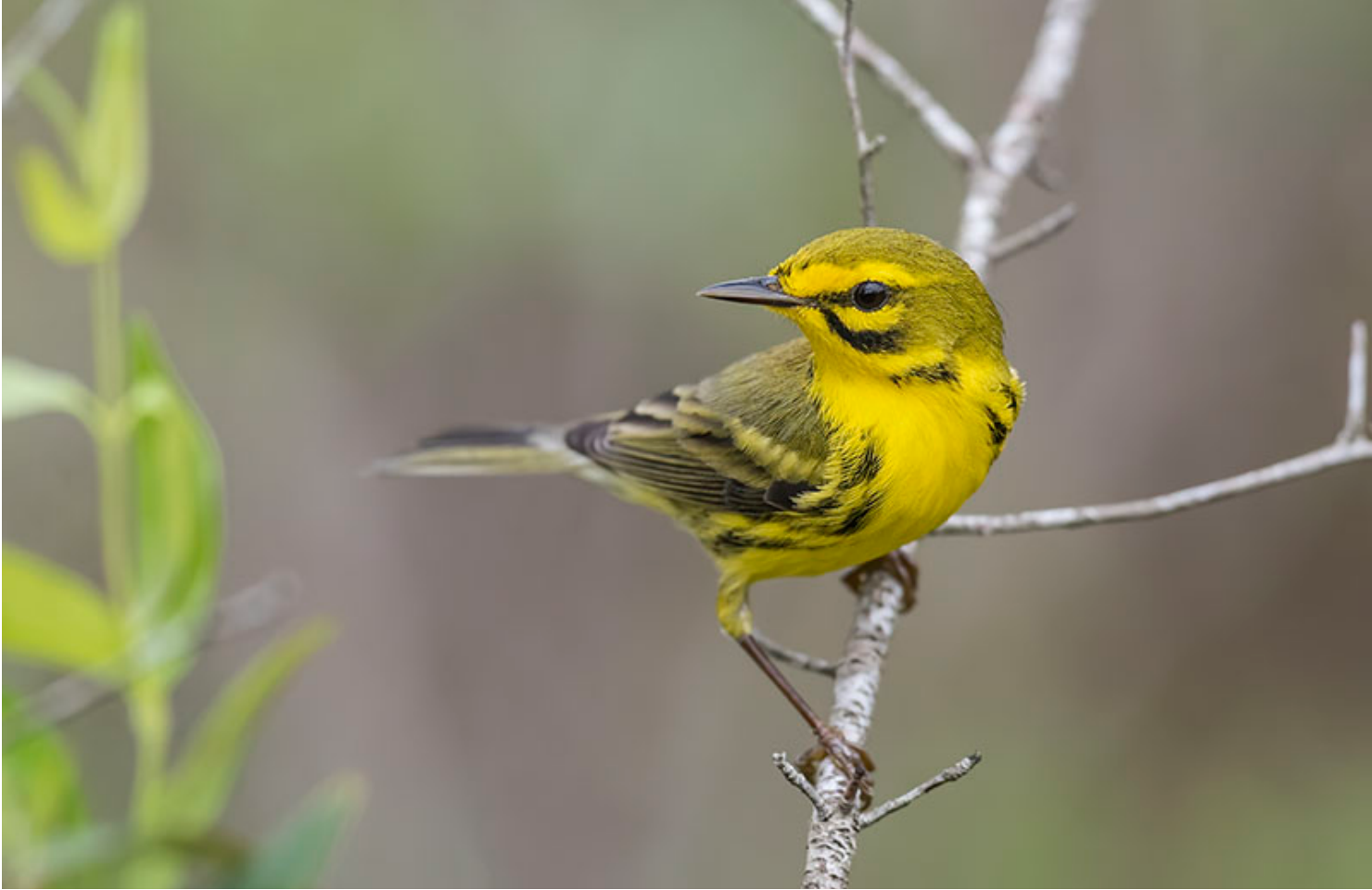
Prairie Warbler, a delightful species at close range in the Pineywoods.