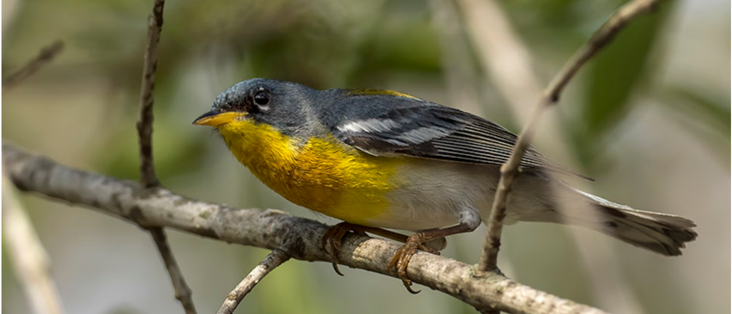
There were three "flavors" of parulas around Neal's Lodges: Tropical, Northern, and a hybrid of the two, like this individual!