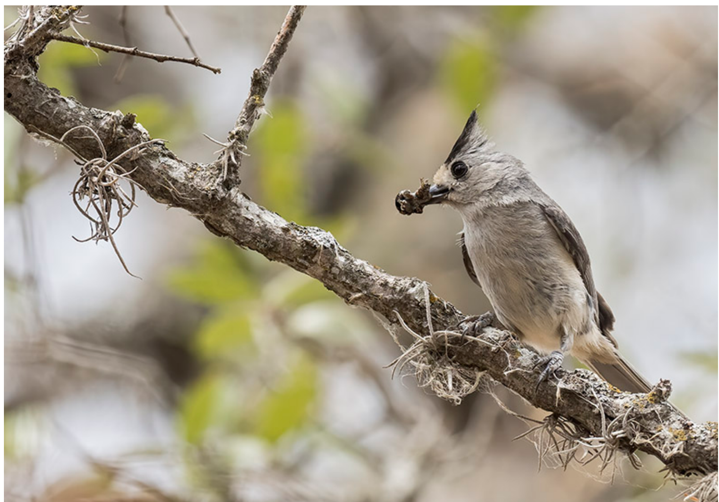
In the Hill Country, the local titmouse is Black-crested Titmouse, a Texas near-endemic.