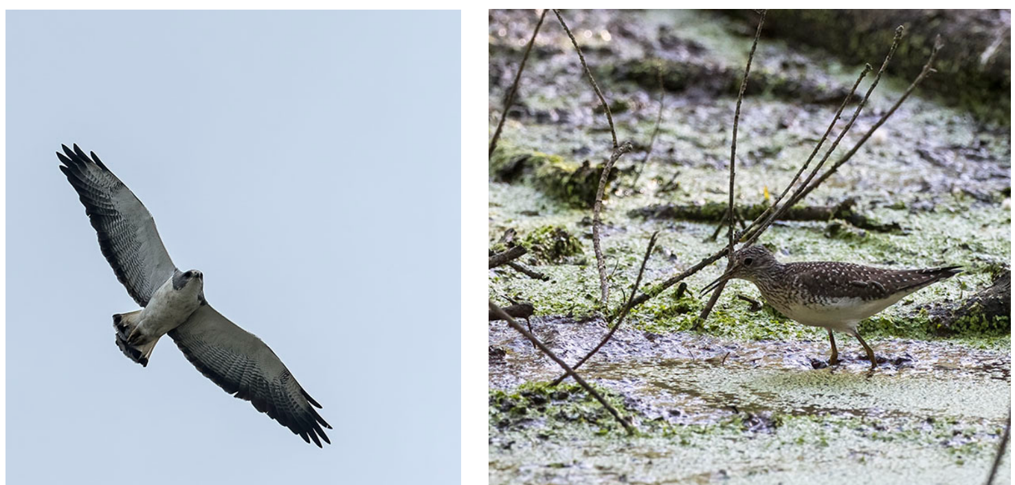
White-tailed Hawk (left) is resident in coastal prairies. Solitary Sandpiper (right) is a passage migrant.