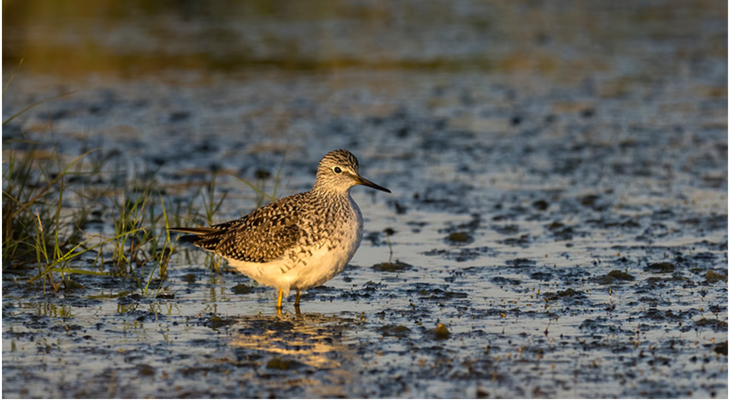
Lesser Yellowlegs were conspicuously migrating in big numbers on the first morning of our trip.