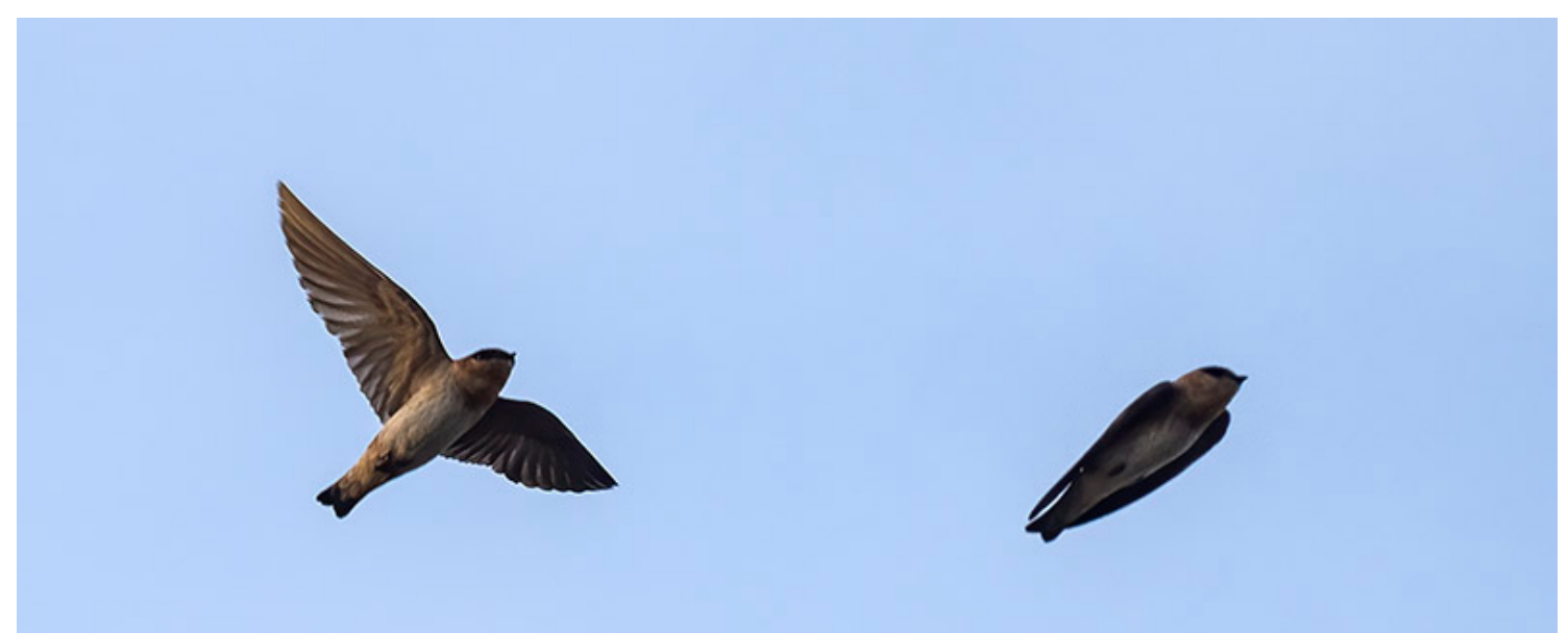
Cave Swallows share the Rio Frio caves with the bats.