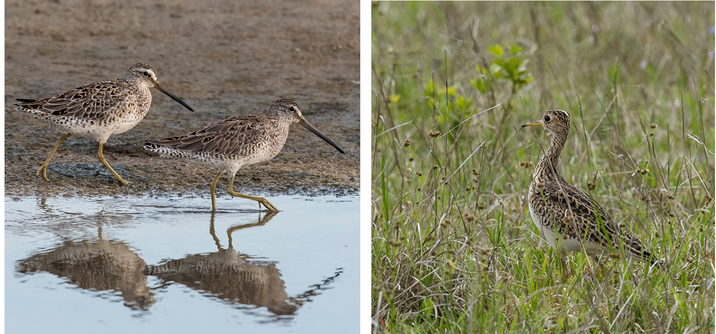
The Upper Texas Coast in April has some of the absolute best shorebirding on Earth. Shown here are Short-billed Dowitchers (left) and Upland Sandpiper (right).