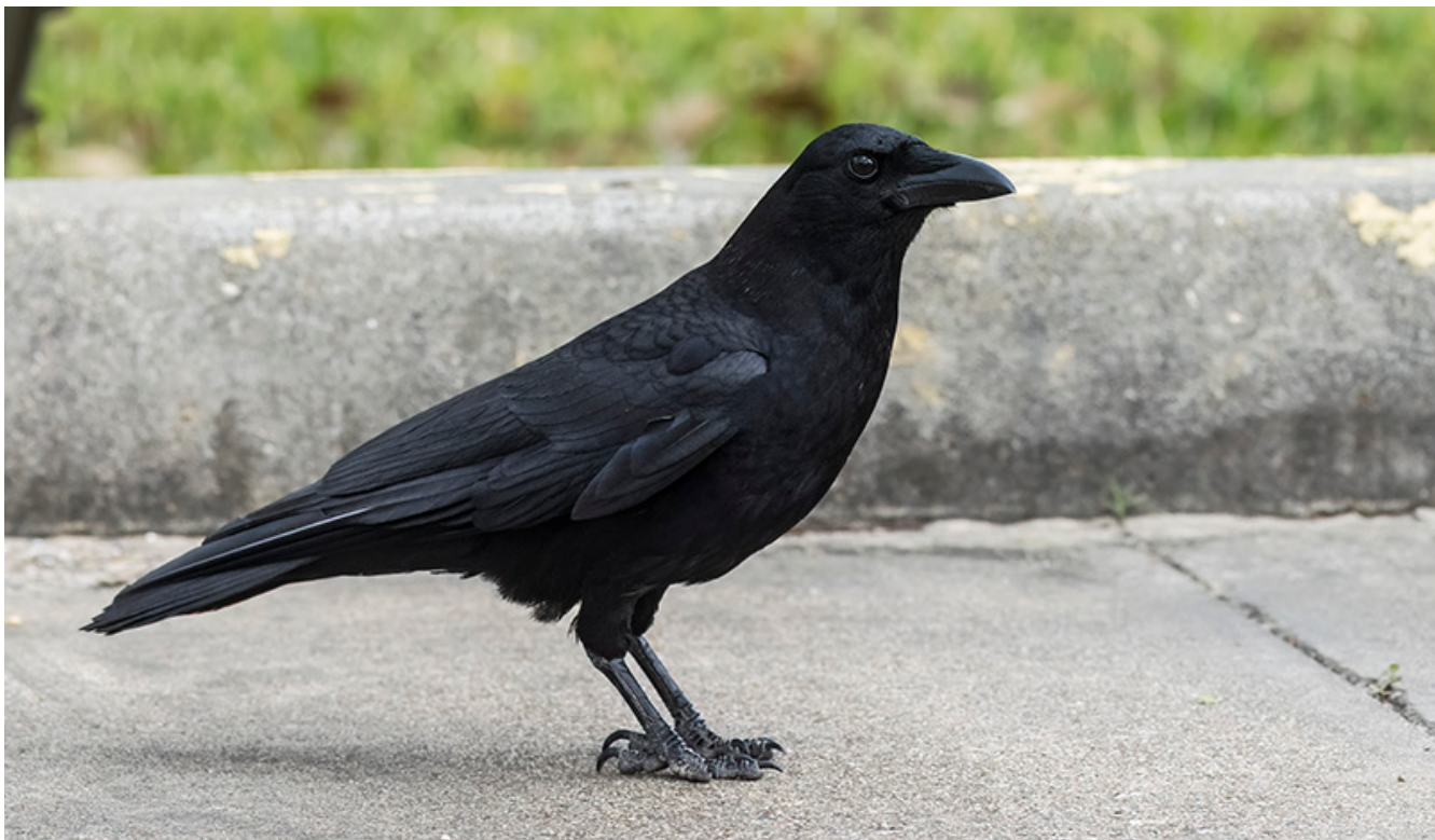
This Fish Crow finally vocalized, removing all doubt about its identity!