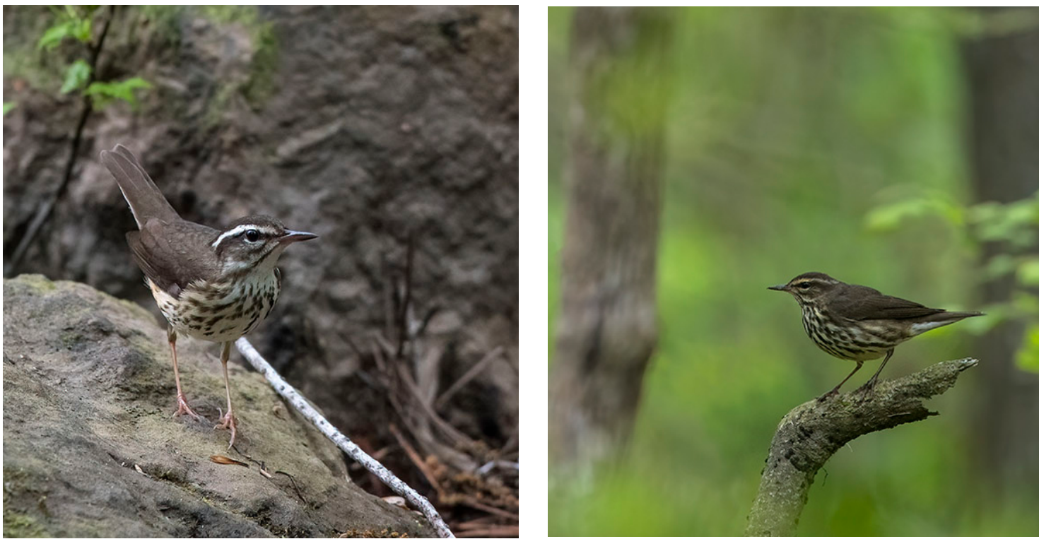
This tour featured both species of waterthrush: Louiaiana (left) and Northern (right). Very similar species!