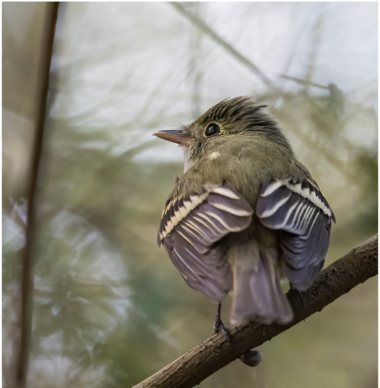
A migrant Acadian Flycathcer, in the Houston Audubon Smith Oaks Sanctuary, on High Island.