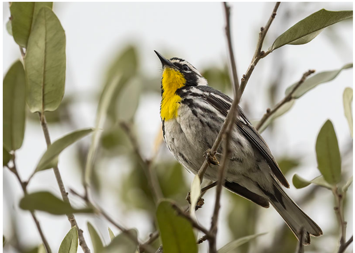
We saw Yellow-throated Warbler both in the Pineywoods and the Hill Country.