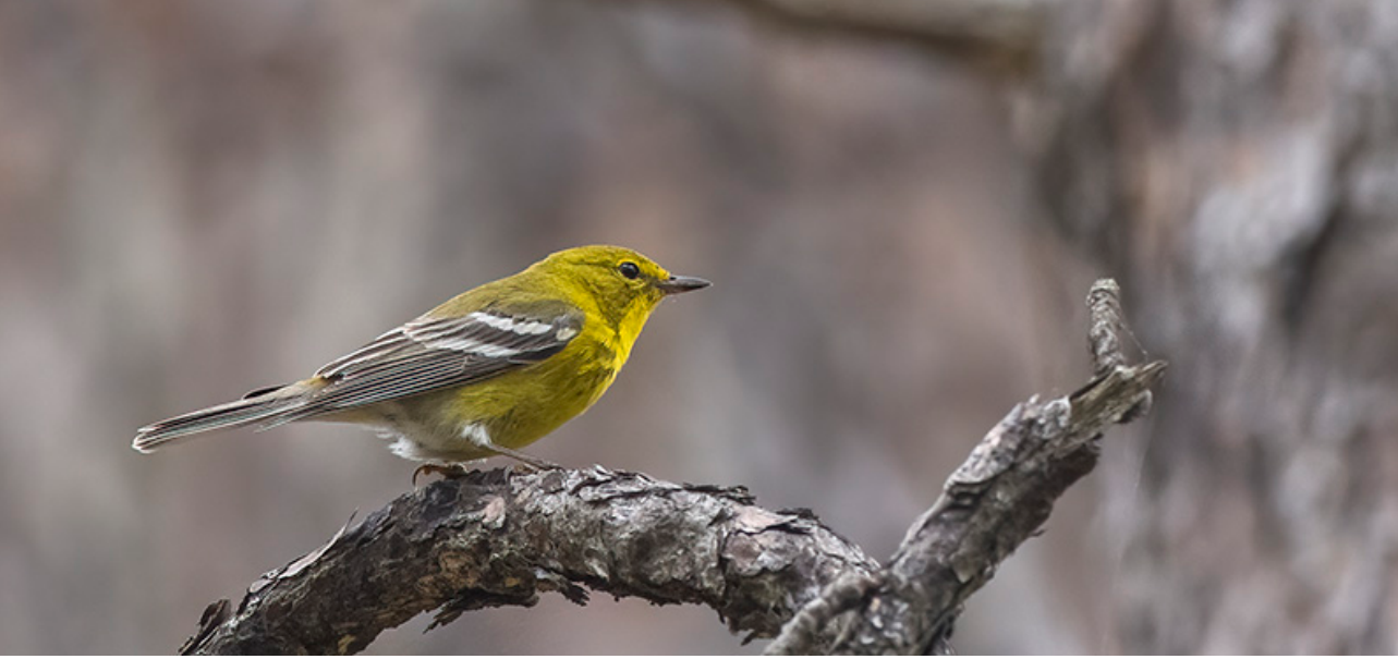
Pine Warbler is (perhaps not surprisingly) quite common in the Pineywoods.