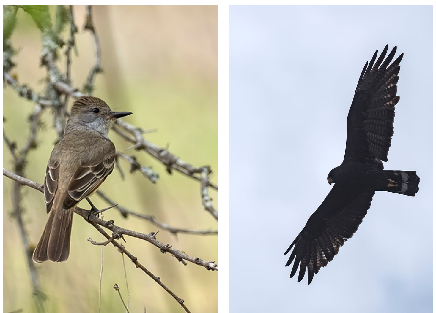
Classic "western" species in the Hill Country: Ash-throated Flycatcher (left) and Zone-tailed Hawk (right).