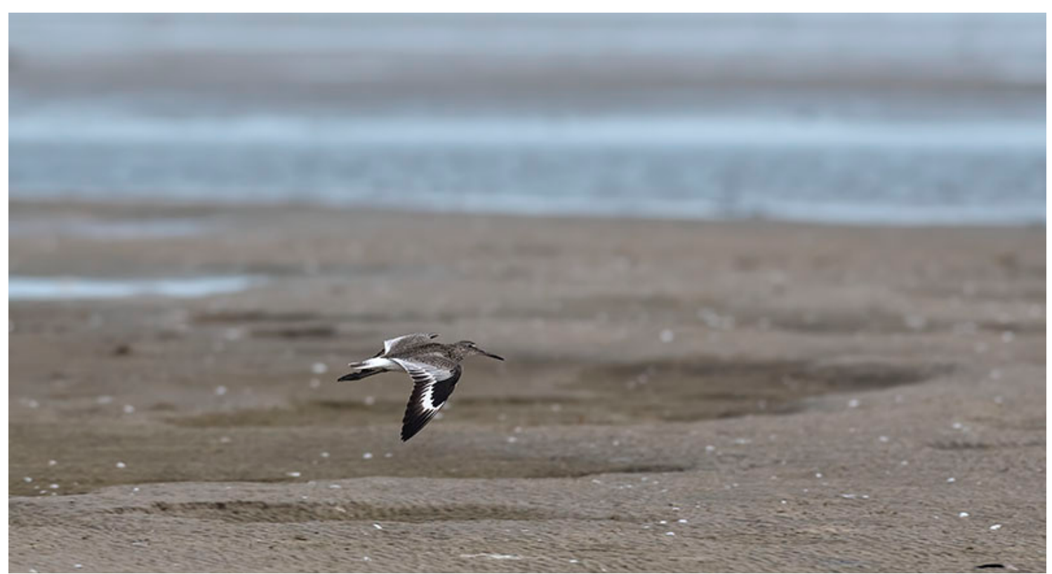
Willet is mostly gray when perched, but quite striking in flight.