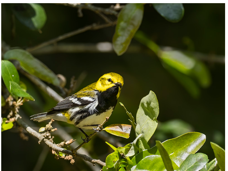
Black-throated Green Warbler, a long-distance migrant warbler that we saw in High Island and Sabine Woods.

Our base for our days on the Upper Texas Coast was Winnie, a sleepy town next to the I-10 interstate. One of Winnie's virtues is that a pair of Whooping Cranes has taken up residence nearby in recent years. We stopped to look for them one morning at one of their favored fields. After a long scan, I didn't see anything, then suddenly I spotted two huge white birds flying in from the other side of