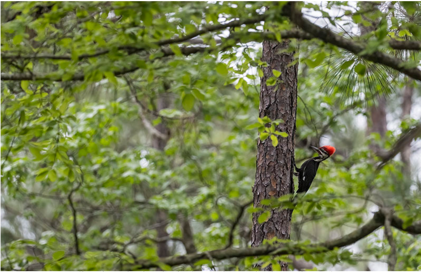
Pileated Woodpecker, the classic "woody" woodpecker! Boiken Springs.