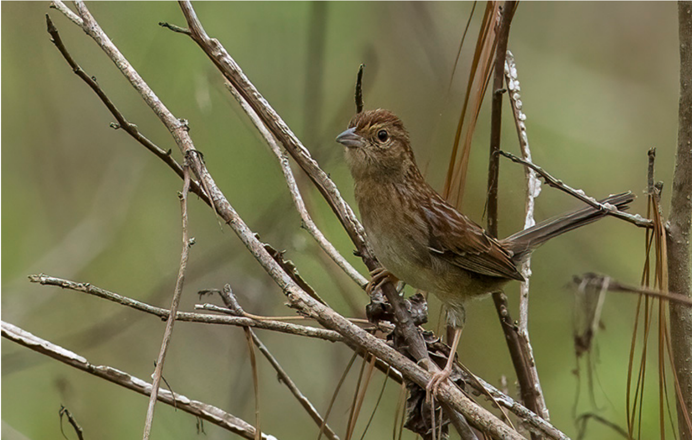
We had phenomenal views of the shy Bachman's Sparrow in the Pineywoods.