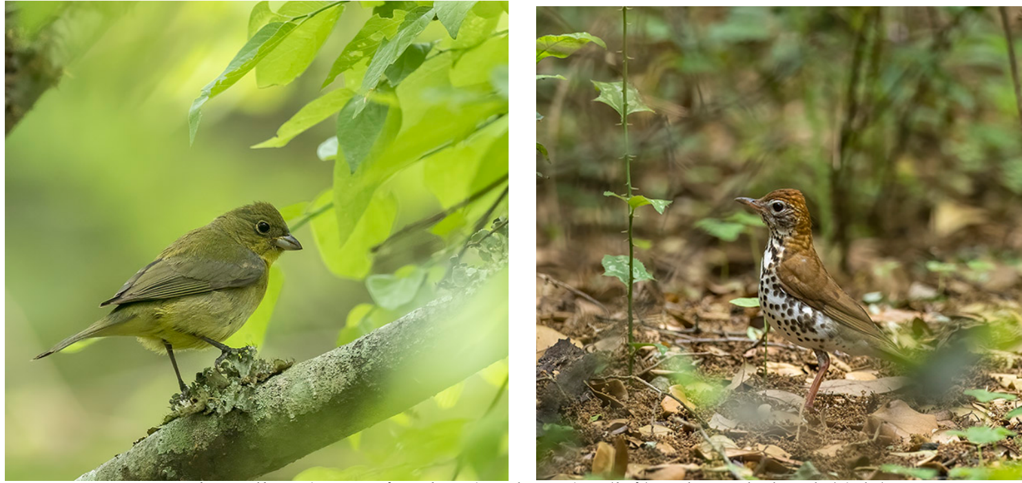
Coastal woodlot migrants: female Painted Bunting (left) and Wood Thrush (right).