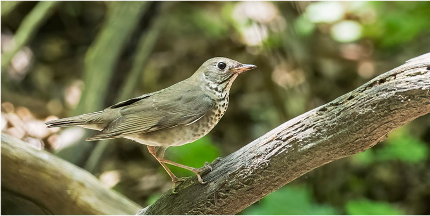
Late migrant Gray-cheeked Thrushes were just arriving at the time of our tour.