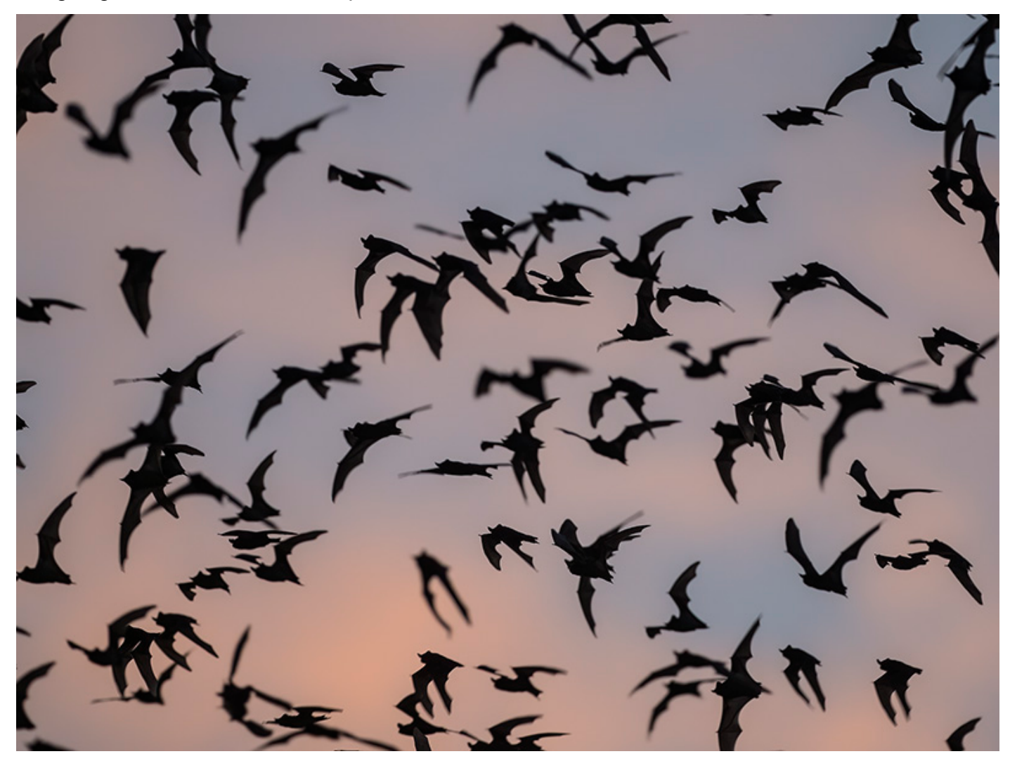
About 60 of the multiple millions of Mexican Free-tailed Bats that we saw emerging at dusk.

The Hill Country is without a doubt the most biogeographically fascinating place in North America. It has a unique mix of eastern, western, and southern species. You can be in the bottom of a valley with a cypress swamp, full of breeding Northern Parulas and Yellow-throated Warblers, then climb up a slope into juniper woodland with Ash-throated Flycatchers and Canyon Wrens! It's like going from a Louisiana swamp into the mountains of Utah in a few hundred feet!