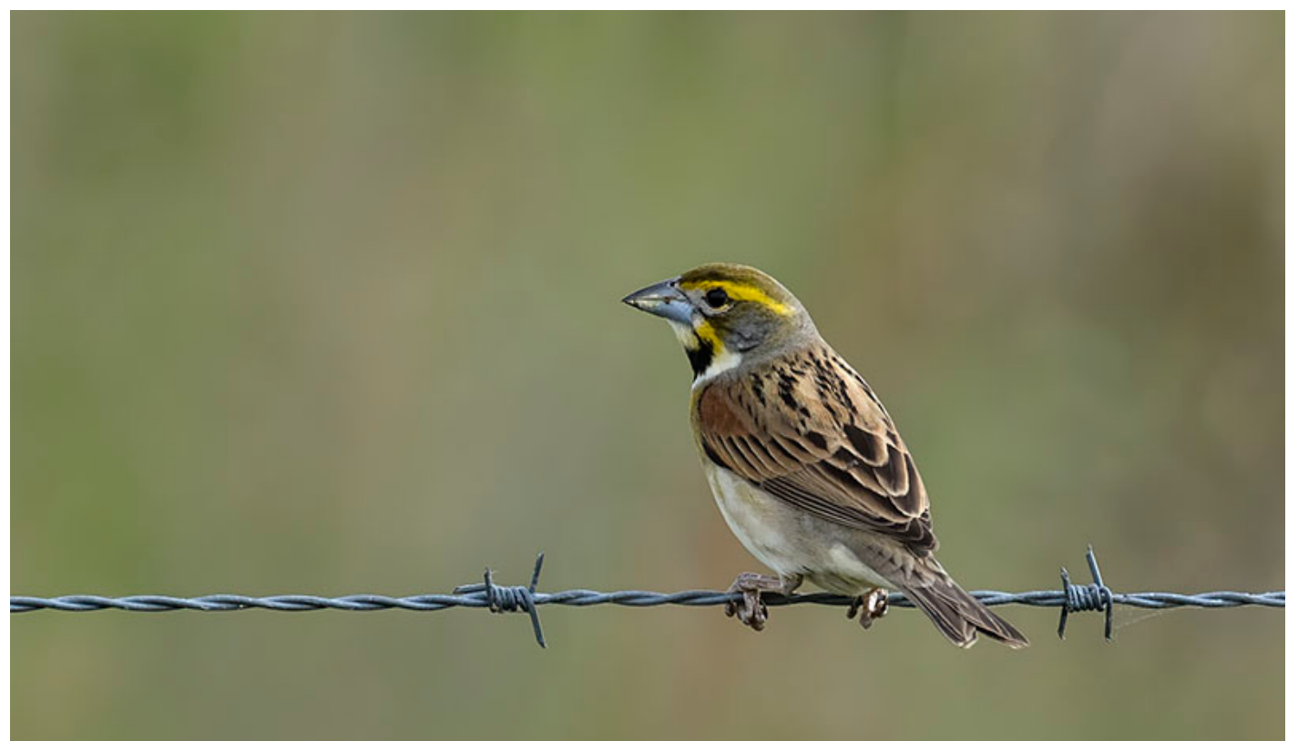
Dickcissels were surprisingly tricky to find, but we finally connected with a few near Winnie.