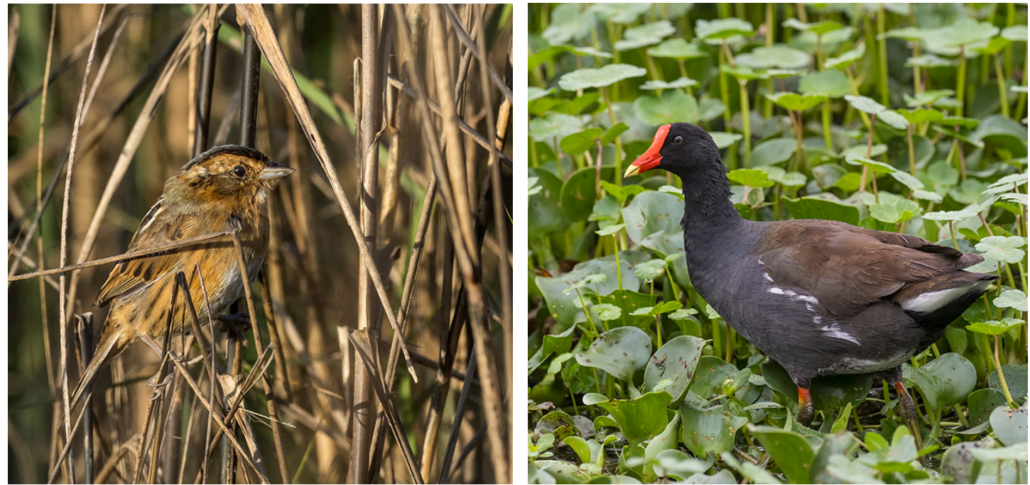
Marsh birds, salt and fresh: Nelson's Sparrow (left) and Common Gallinule (right).