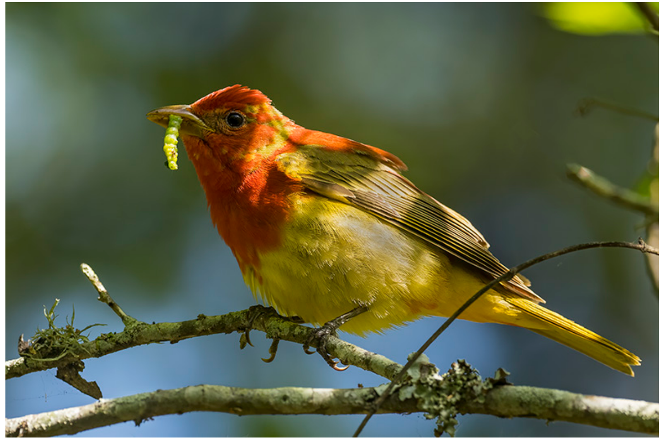
On our morning in Sabine Woods, there were loads of Summer Tanagers.