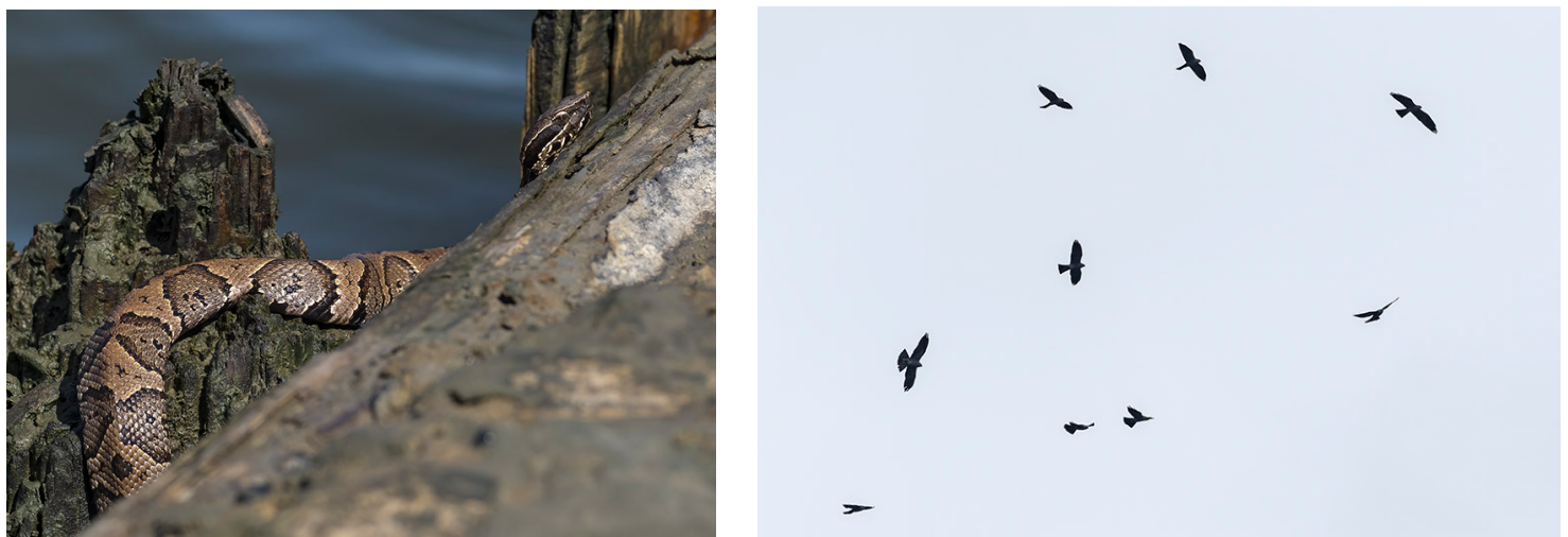
On our first morning, we spotted a beautiful Northern Cottonmouth (left). While driving up into the Pineywoods, there were loads of migrating Mississippi Kites in the sky (right).