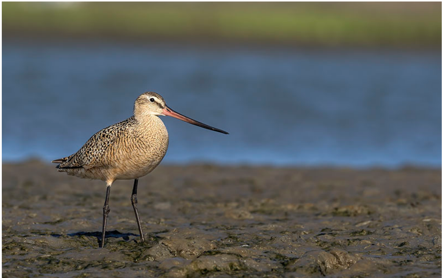
Marbled Godwit is one of two godwits that we saw on this tour. Big, great-looking shorebirds!