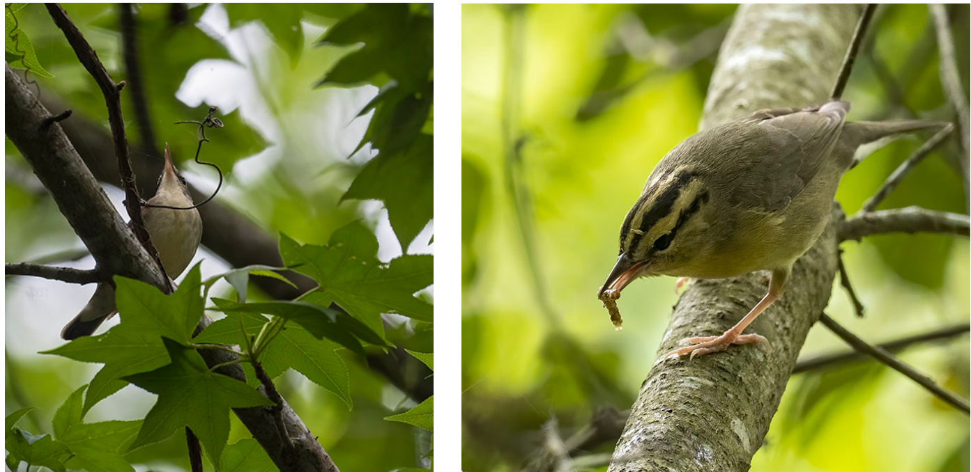
We saw both of North America's "brown warblers": Swainson's (left) and Worm-eating (right).