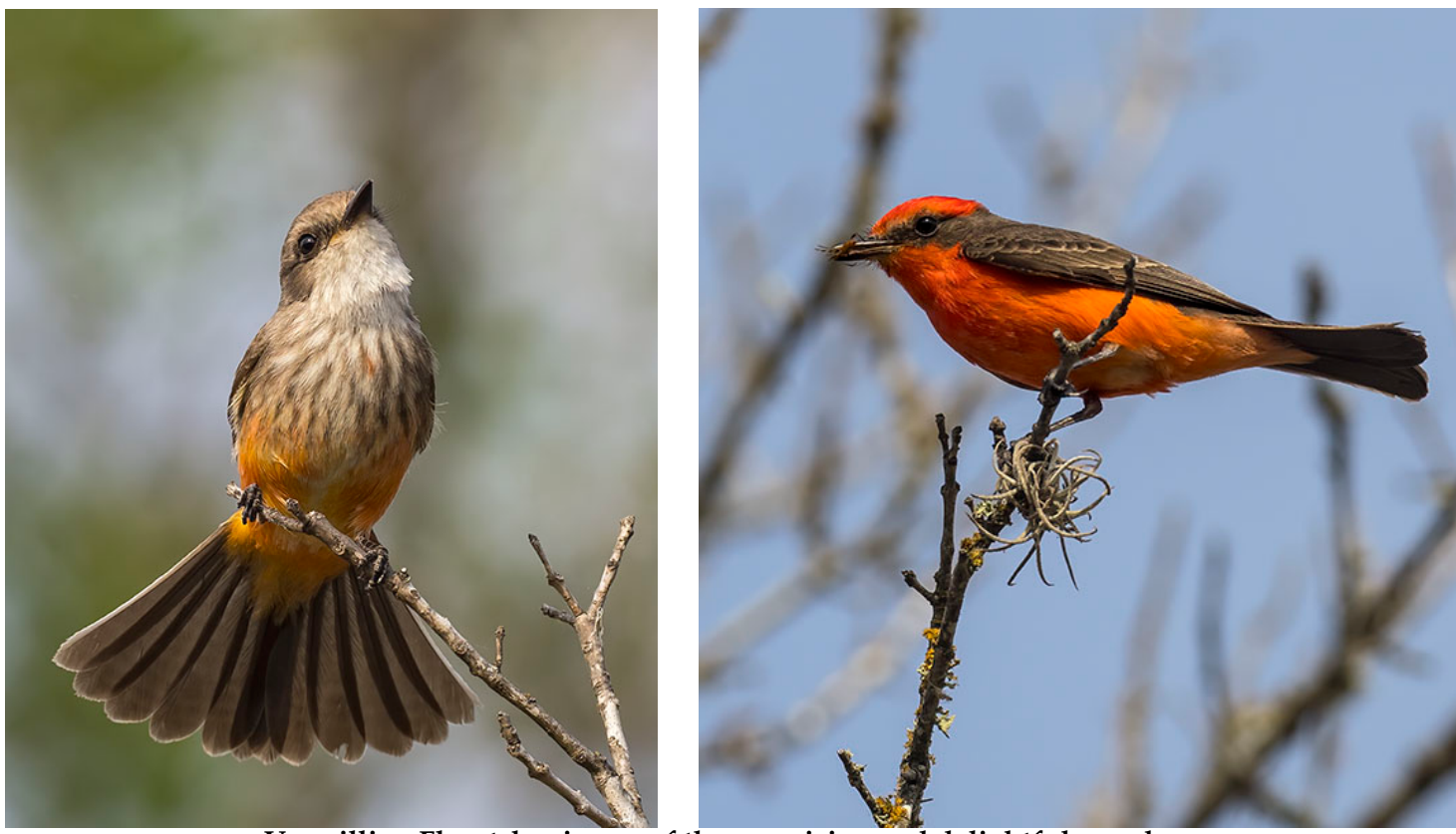
Vermillion Flycatcher is one of the surprising and delightful members of the bird assemblage in the Hill Country.