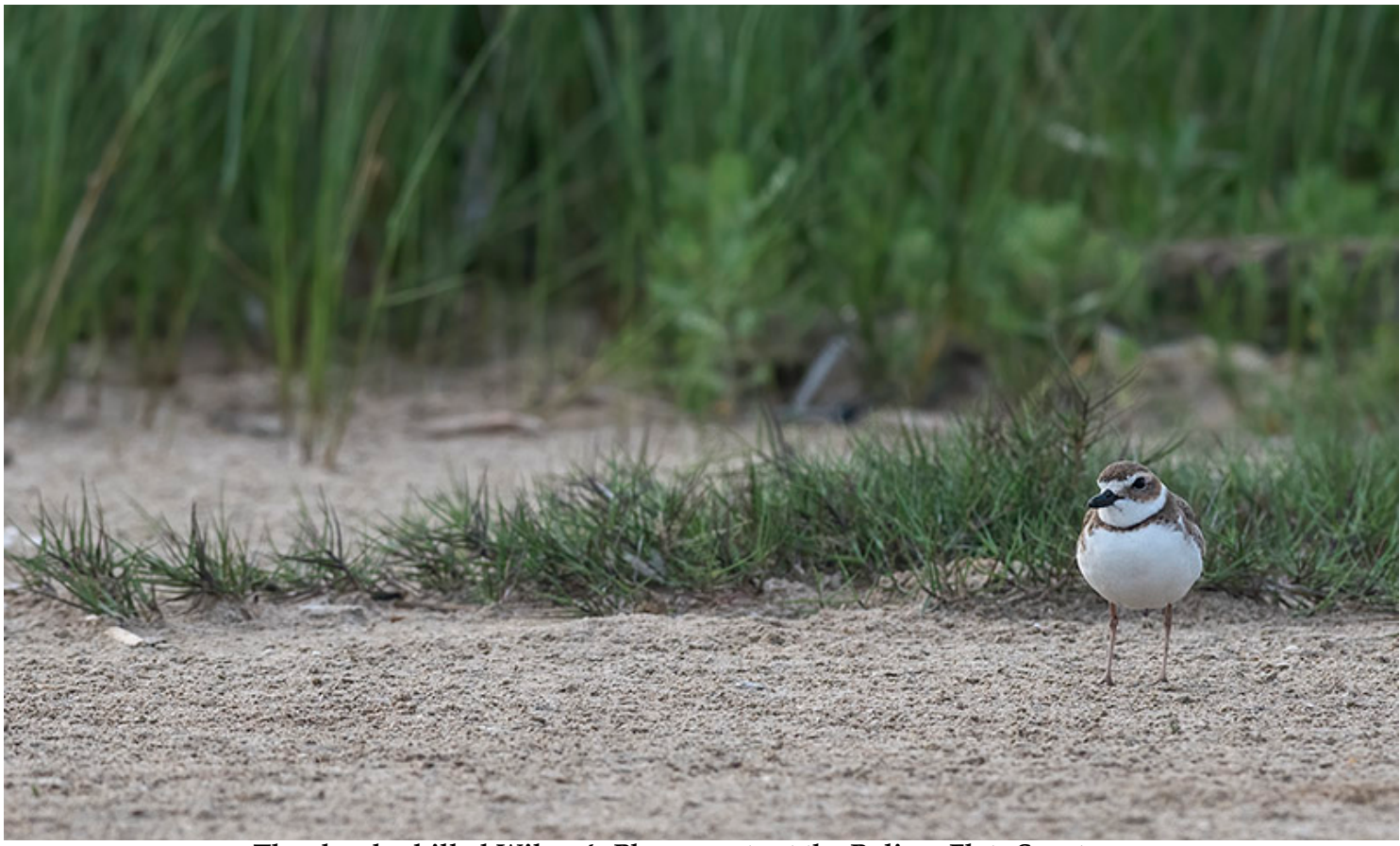
The chunky-billed Wilson's Plover nests at the Bolivar Flats Sanctuary.