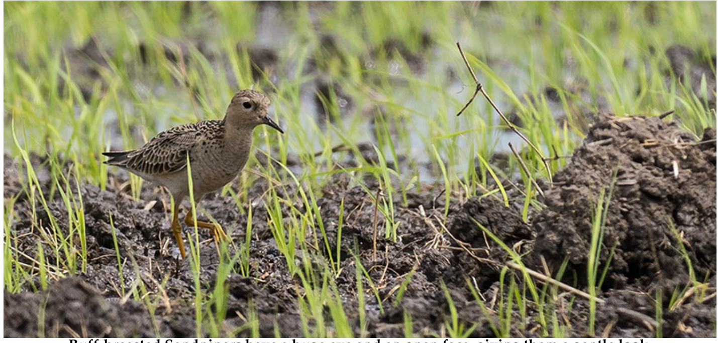
Buff-breasted Sandpipers have a huge eye and an open face, giving them a gentle look.