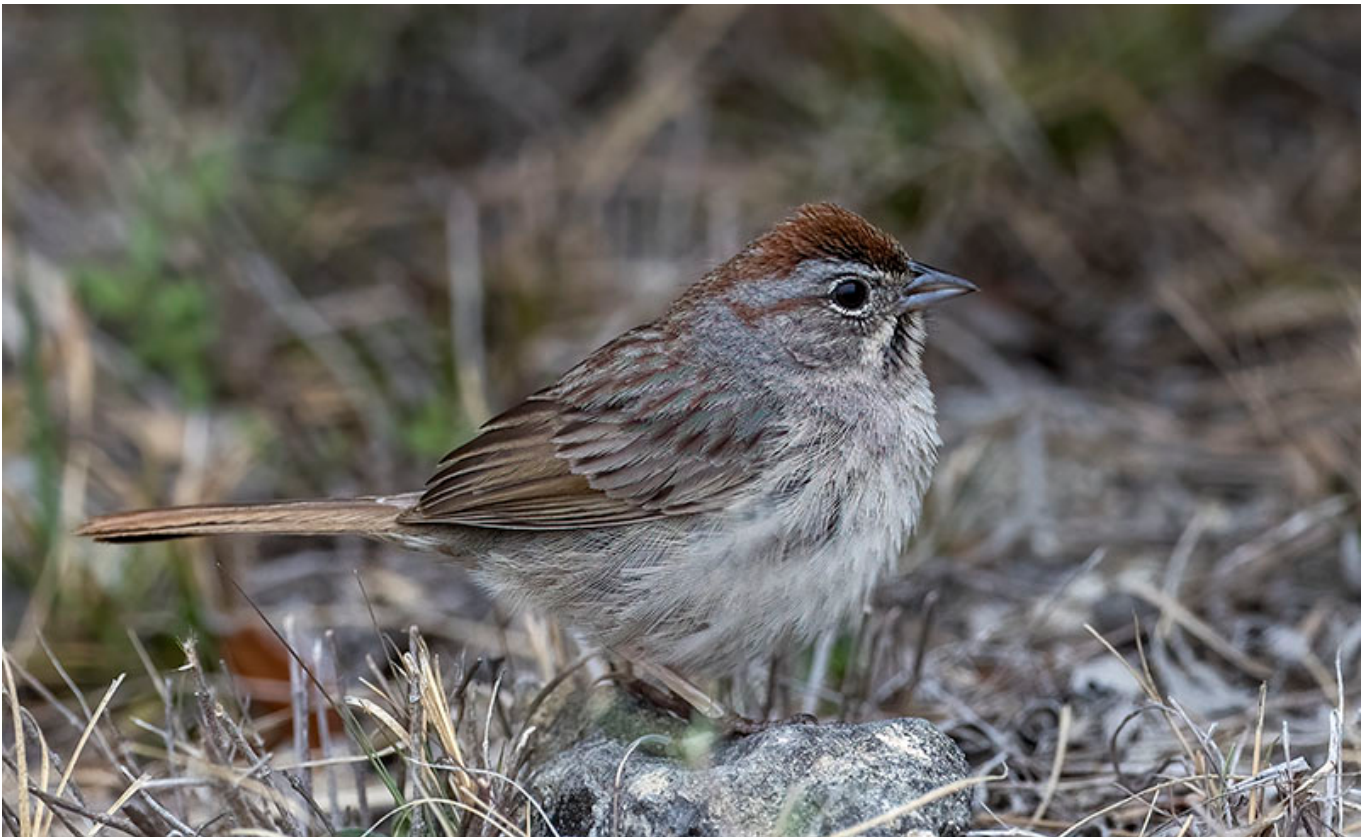
Rufous-crowned Sparrow, a final addition to our sparrow list, in the Hill Country near Kerrville.