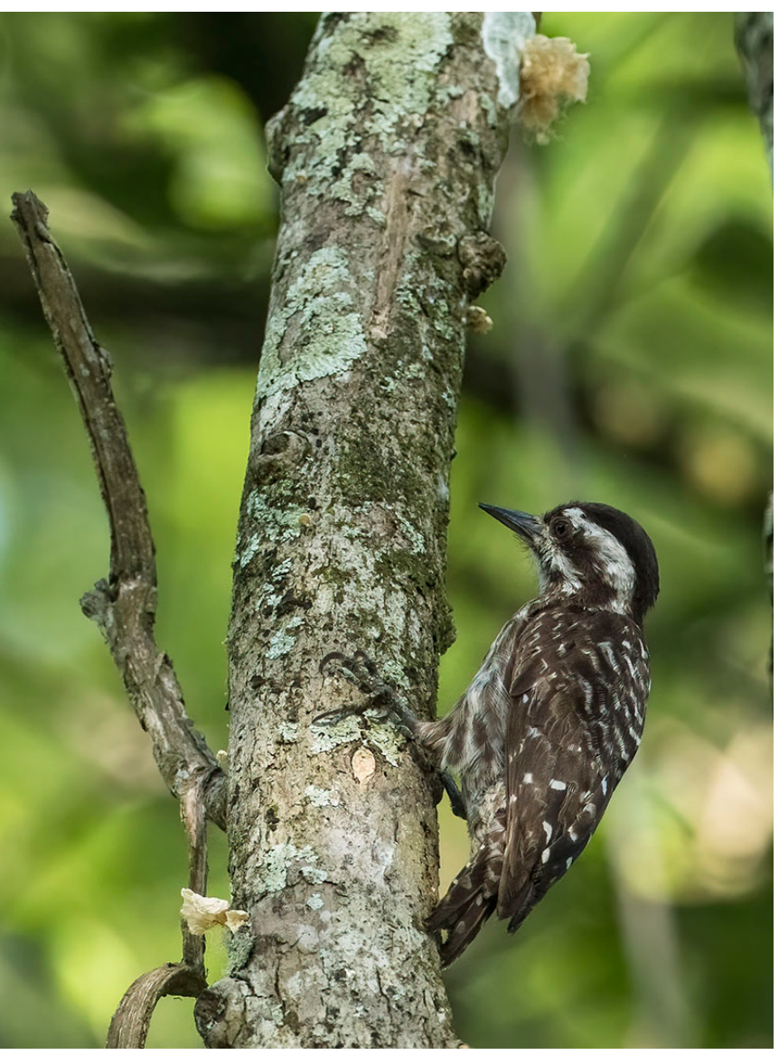
Sunda (Pygmy) Woodpecker on our first morning at Kuala Selangor, in mangrove habitat. This area holds a surprising richness of woodpecker species, with two flamebacks, the pygmy, and the Laced Woodpecker.

After a night in a fabulous Kuala Lumpur hotel, complete with swimming pool, gym, and an amazing buffet, we struck out early for Kuala Selangor. This coastal site has some secondary forest and mangroves, and offers chances for a bunch of species that aren't possible anywhere else on the tour. Our day there was highly productive. In the mangroves, we found all the specialty birds: Golden-bellied Gerygone, Pied Triller, Mangrove Whistler, Mangrove Blue-Flycatcher, and the mangrove-dwelling subspecies of Tit. Cinereous A vocal Little Bronze-Cuckoo was a nice bonus. The dry forest, just inland from the mangroves, was also very good. Here we found Coppersmith and Linneated Barbets, Greater and Common Flamebacks, Laced and