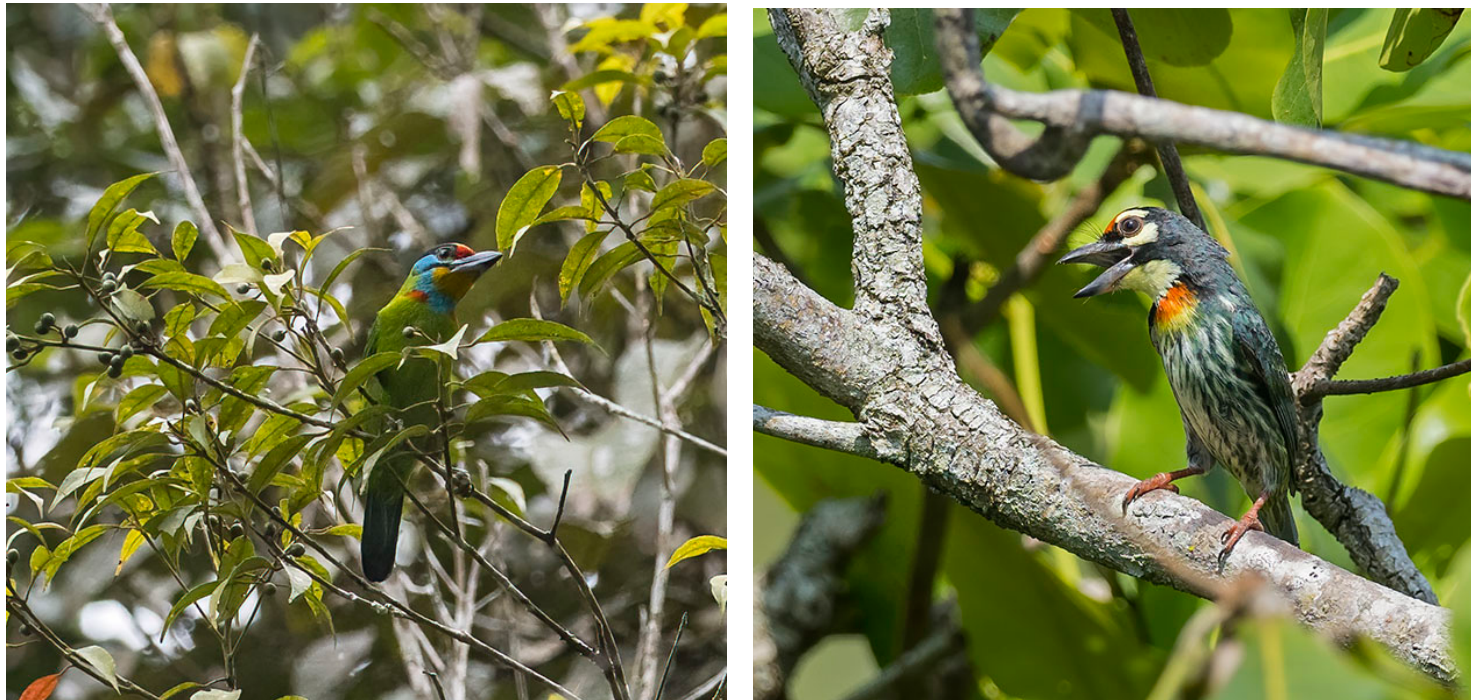
This tour is unusually rich in barbets, including the endemic Black-browed Barbet (left) and widespread Coppersmith Barbet (right).