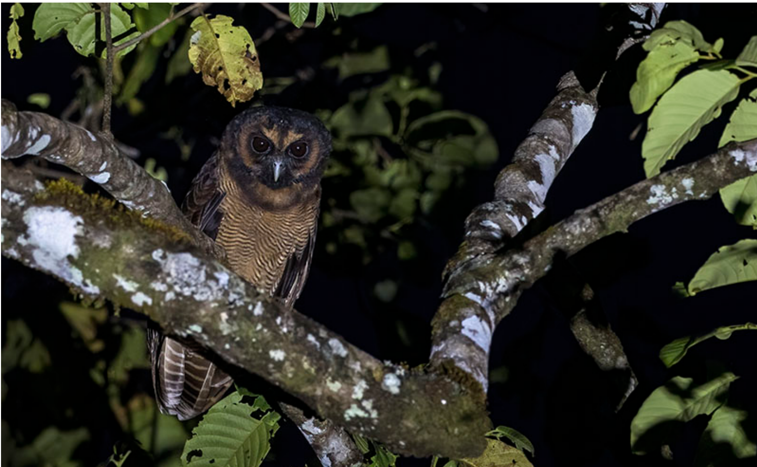
Brown Wood-Owl graced a pre-dawn walk at Fraser's Hill.