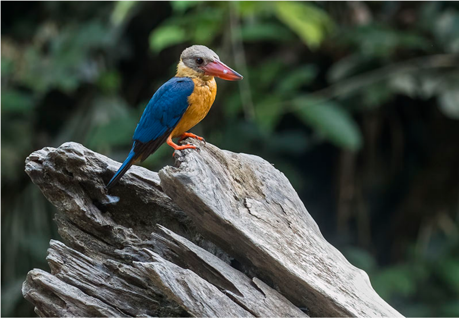
Stork-billed Kingfishers featured on a couple of boat trips in Taman Negara.