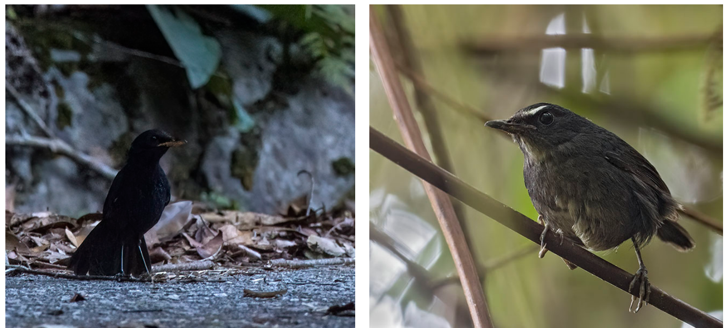
A couple of inveterate skulkers on Fraser's Hill: Malayan Whistling-Thrush (left) and Lesser Shortwing (right).