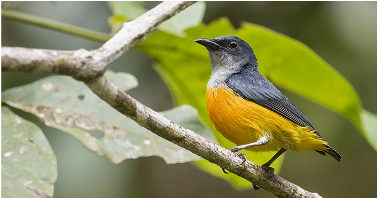
Orange-bellied Flowerpecker, a common bird of the lowlands, in both forest and disturbed areas.