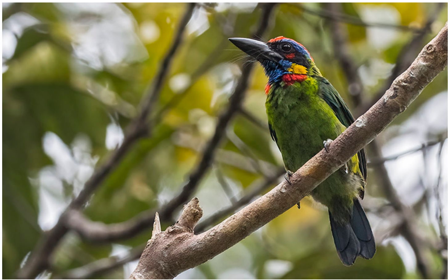
Red-crowned Barbet is an extreme lowland forest specialist, which we saw very well in Panti.