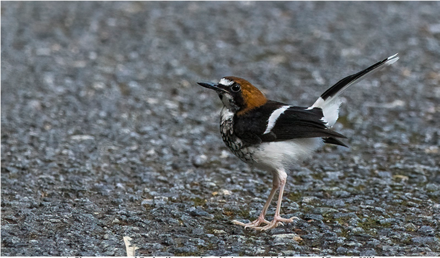
A Chestnut-naped Forktail greeted us during our initial ascent of Fraser's Hill.