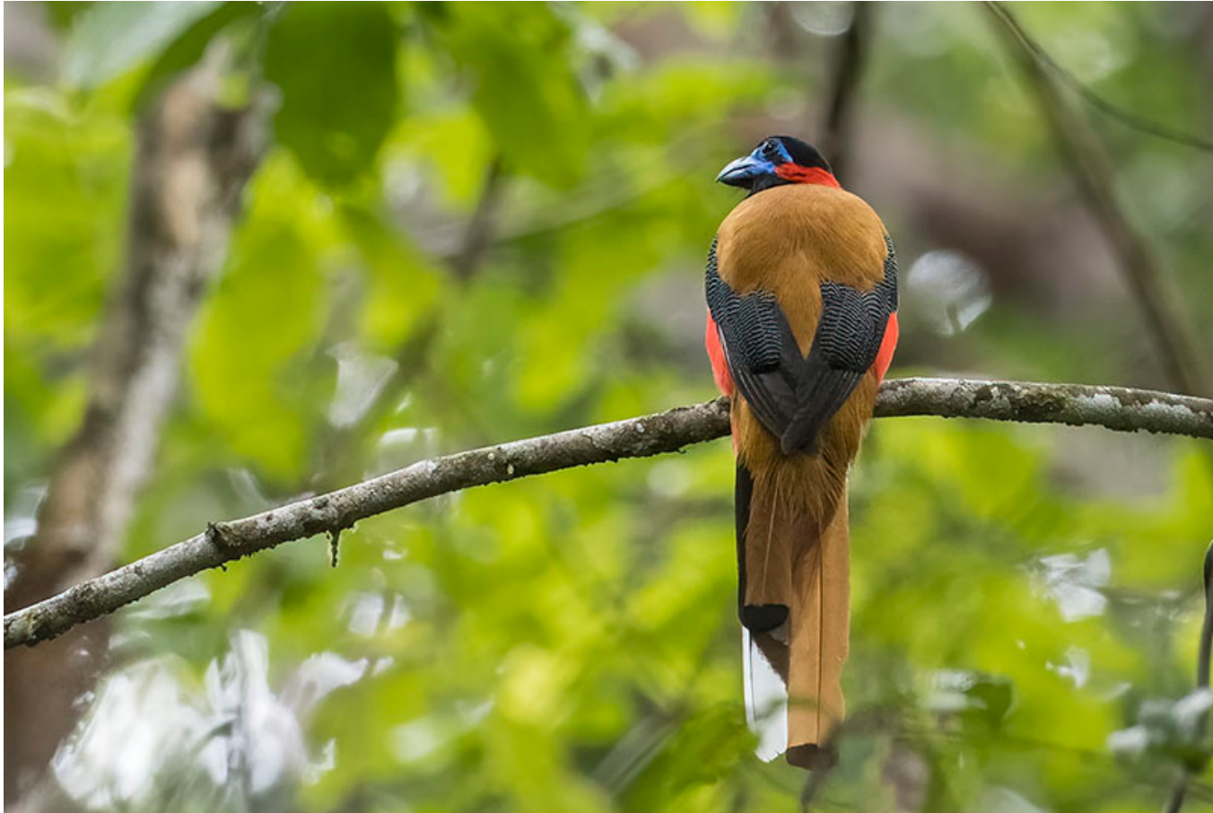
Red-naped Trogon is a hefty and scarce rainforest trogon.