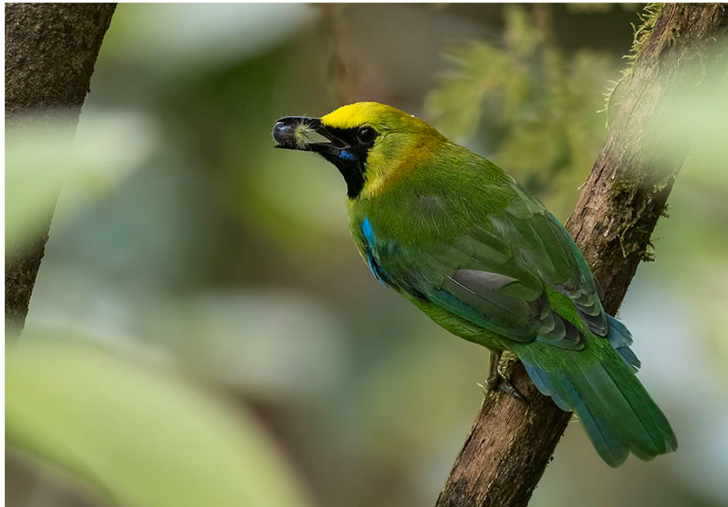
Blue-winged Leafbird chowing down on fruits in Panti Forest.