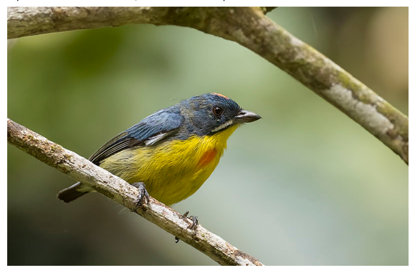
The generally scarce Crimson-breasted Flowerpecker is wonderfully common in Panti Forest.

Garnet Pitta, Pied Triller, Black-and-crimson Oriole, Black Magpie, the monotypic families that are Malaysian Rail-Babbler and Crested Shrikejay, Large, Eyebrowed, and Striped Wren-Babblers, Sultan Tit, Black-and-white, Scaly-breasted, Gray-breasted, Straw-colored, and Finsch's Bulbuls, Velvet-fronted and Blue Nuthatches, incredible views of Pygmy Cupwing (representing a small, cool Asian family), endemic Black and Malayan Laughingthrushes, Mangrove Blue-Flycatcher, Crimson-breasted Flowerpecker, and White-headed and White-crowned Munias. We had a couple of keen family listers on this trip, who were new to Asian birding, and they racked up an impressive 22 new bird families, all the conceivable options at the sites we visited!