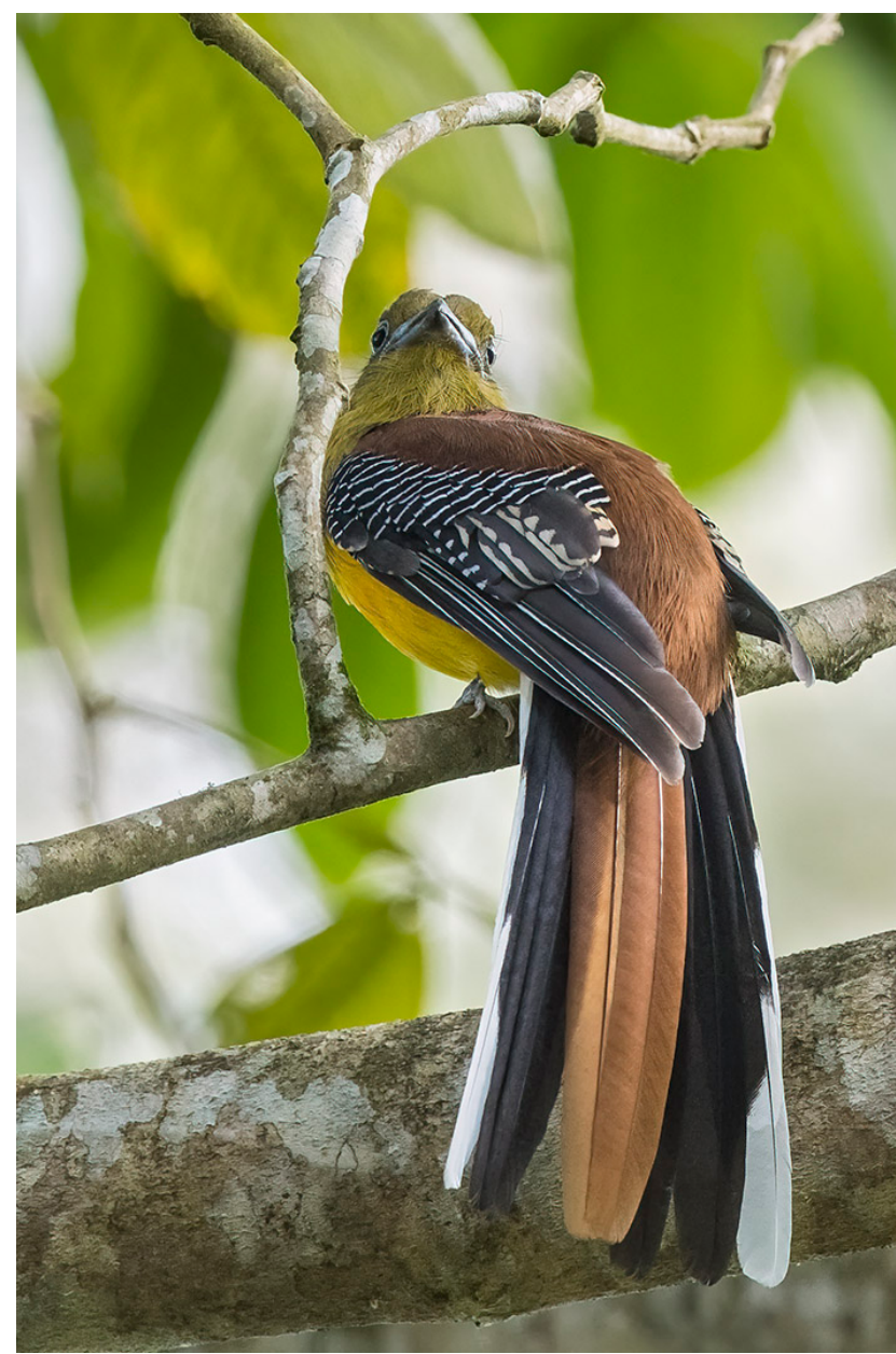
Our last-minute sighting of Orange-breasted Trogon on Bukit Tingii was a delight.

worthwhile when we sighted a juvenile Orange-breasted Trogon being fed by