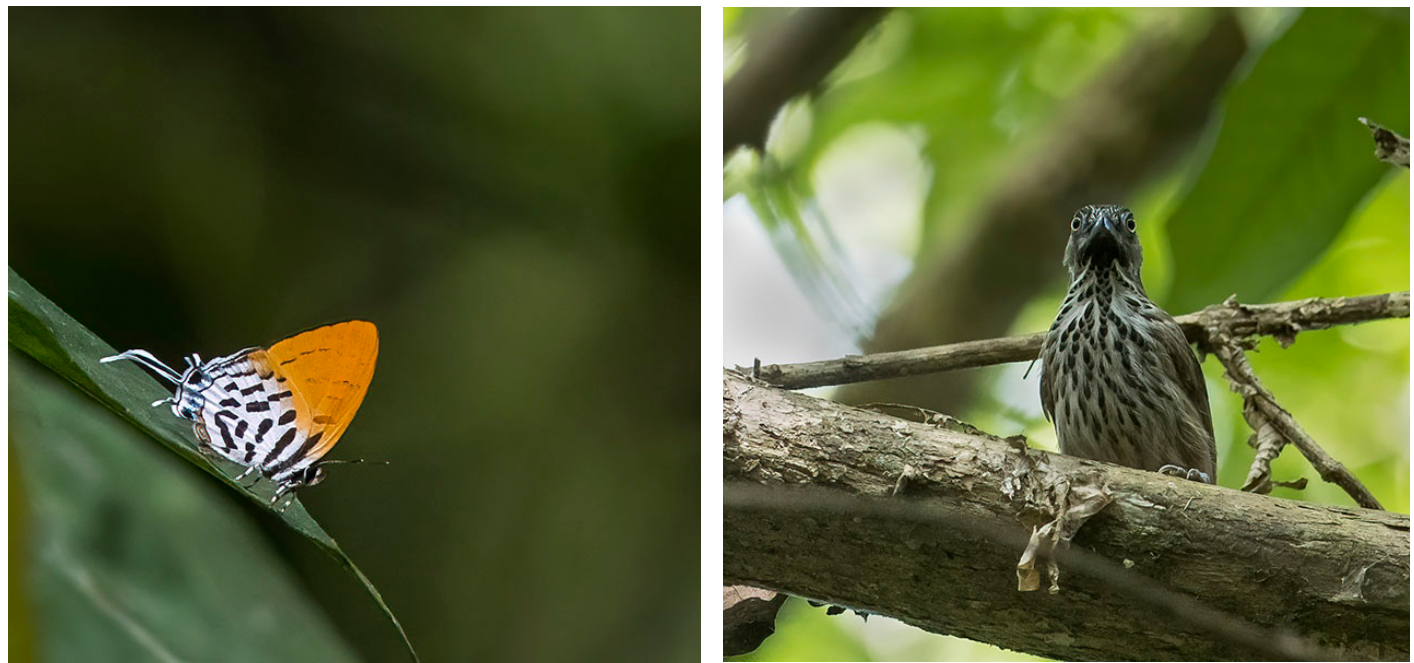
Common Posy (left), an exotic hairstreak. Chestnut-rumped Babbler (right). Both in Taman Negara.