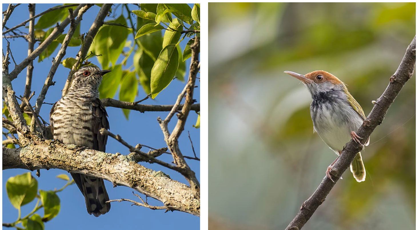
Dinky delights: Little Bronze-Cuckoo (left) and Dark-necked Tailorbird (right).