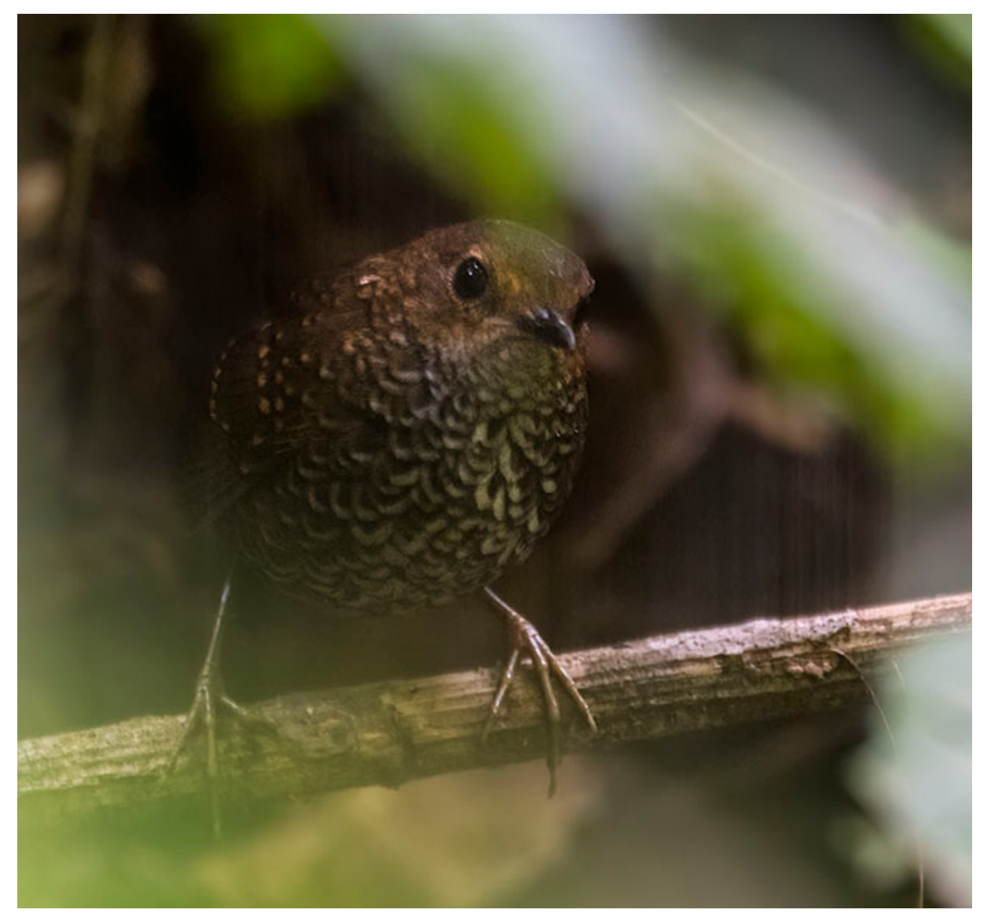
Small Bird. Kind of a Big Deal. The diminutive Pygmy Cupwing took home "Bird of the Trip" honors!

Pygmy Cupwing – 22 VOTES. As a small family that is endemic to Asia, this was a major target for several participants. After some effort, we enjoyed views of this cupwing only a few feet away! So much character in a tiny package!