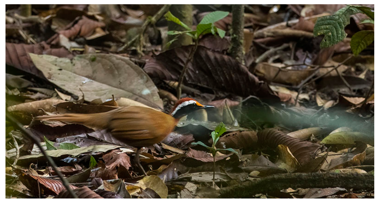
It took sweaty days and hours of effort, but we finally had great Rail-Babbler sightings, both on the main tour and the Panti Extension.

3) Malaysian Rail-Babbler – 14 VOTES. Another huge family target, this one monotypic.