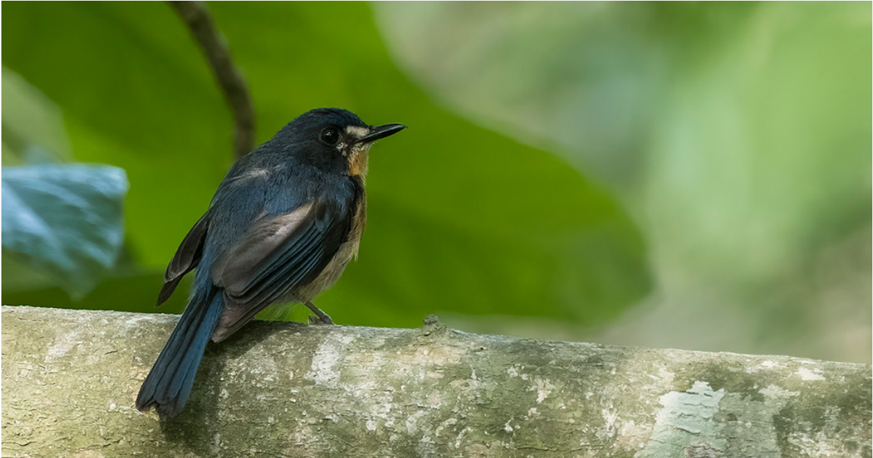
Mangrove Blue Flycatcher in the Kuala Selangor sanctuary.