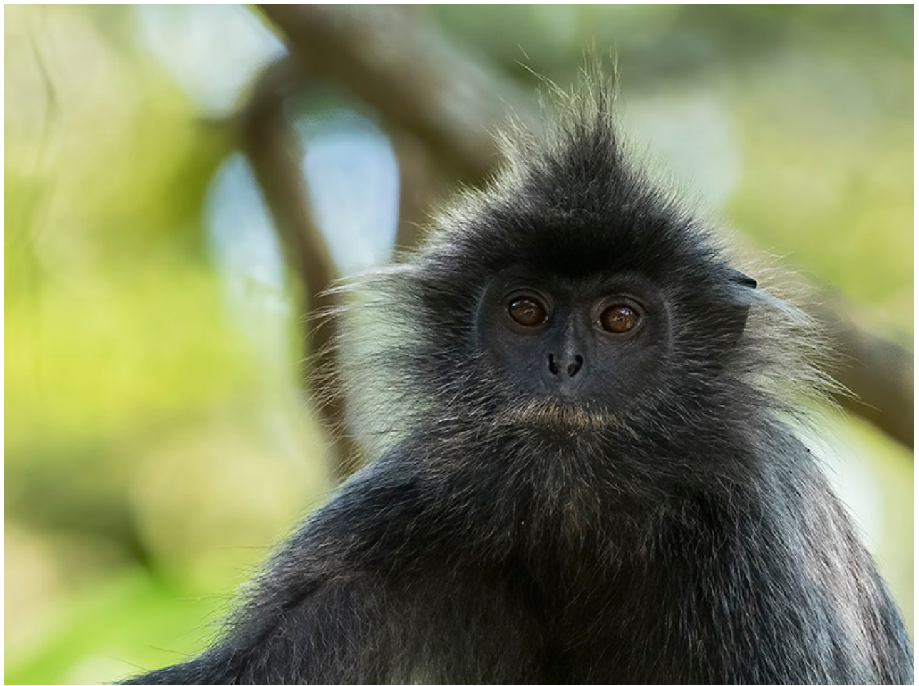
The Selangor Langur is a beautiful monkey that is endemic to the west coast of Peninsular Malaysia.