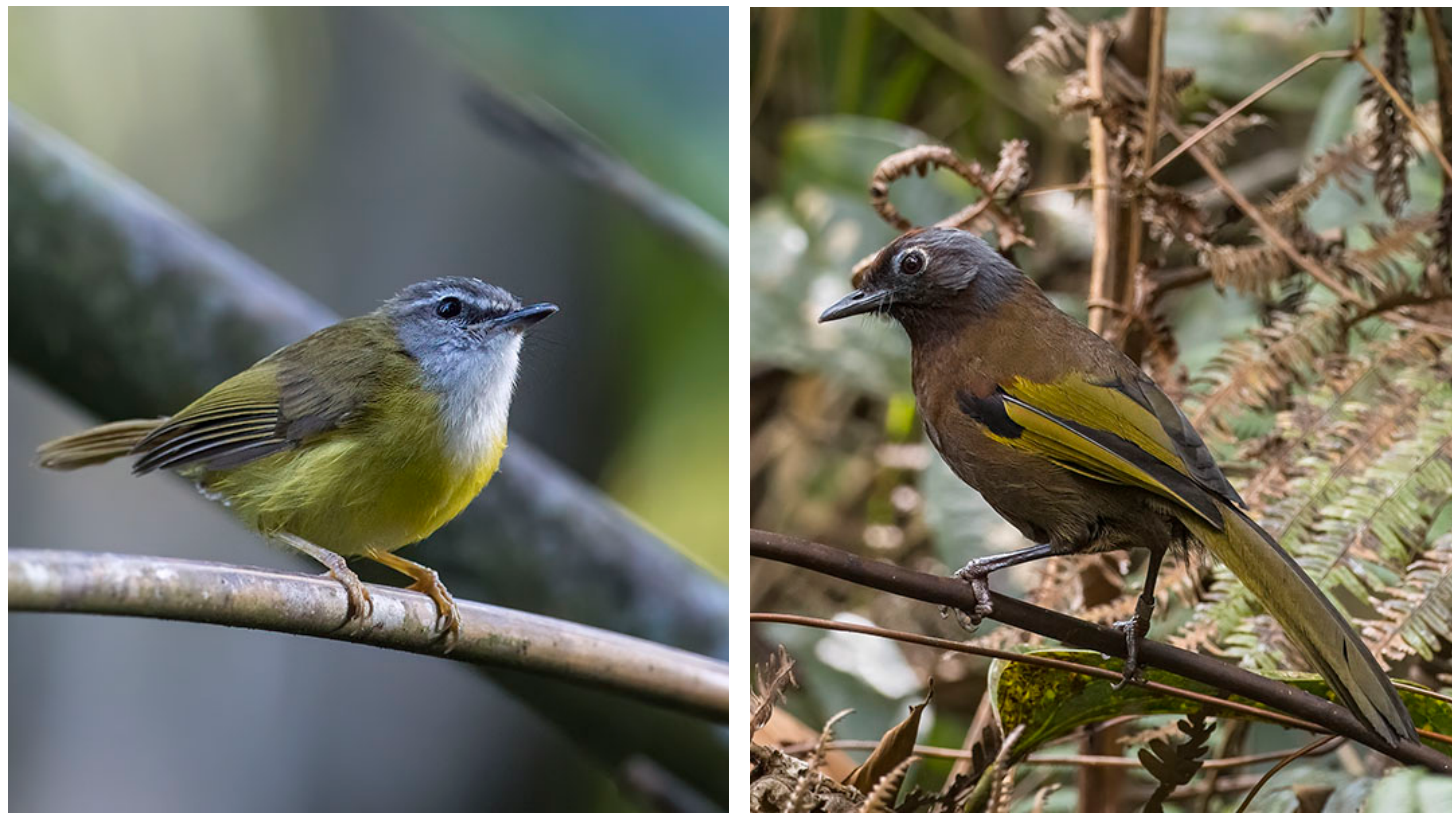
Yellow-bellied Warbler (left) and endemic Malayan Laughingthrush (right).