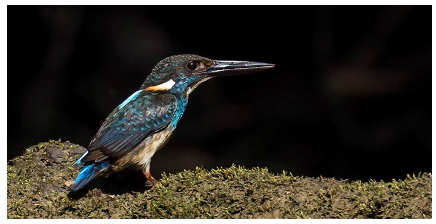
We had several amazing encounters with the scarce Blue-banded Kingfisher.

distance before finally having a closer bird that seemed within reach. But finding this bird still entailed a long session of playback and waiting motionless. Finally our efforts, fieldcraft, and patience paid of when the pitta crossed the trail, right in front of the whole group, even pausing for an exquisite few seconds on a mossy root. The Rail-Babbler makes up its own family, which is related to the wickedly weird picathares of Africa. It's a very shy ground dwelling bird, with a beautiful facial pattern that includes inflatable bluish-purple sacs on the sides of the neck. It's this tour's top target and attraction for family listers, of which we had several on this trip. After days of trying to see this species, persistence finally paid off when we had excellent views of this unique beauty striding through the undergrowth, at a totally different location than where Ken usually finds it. That's birding!