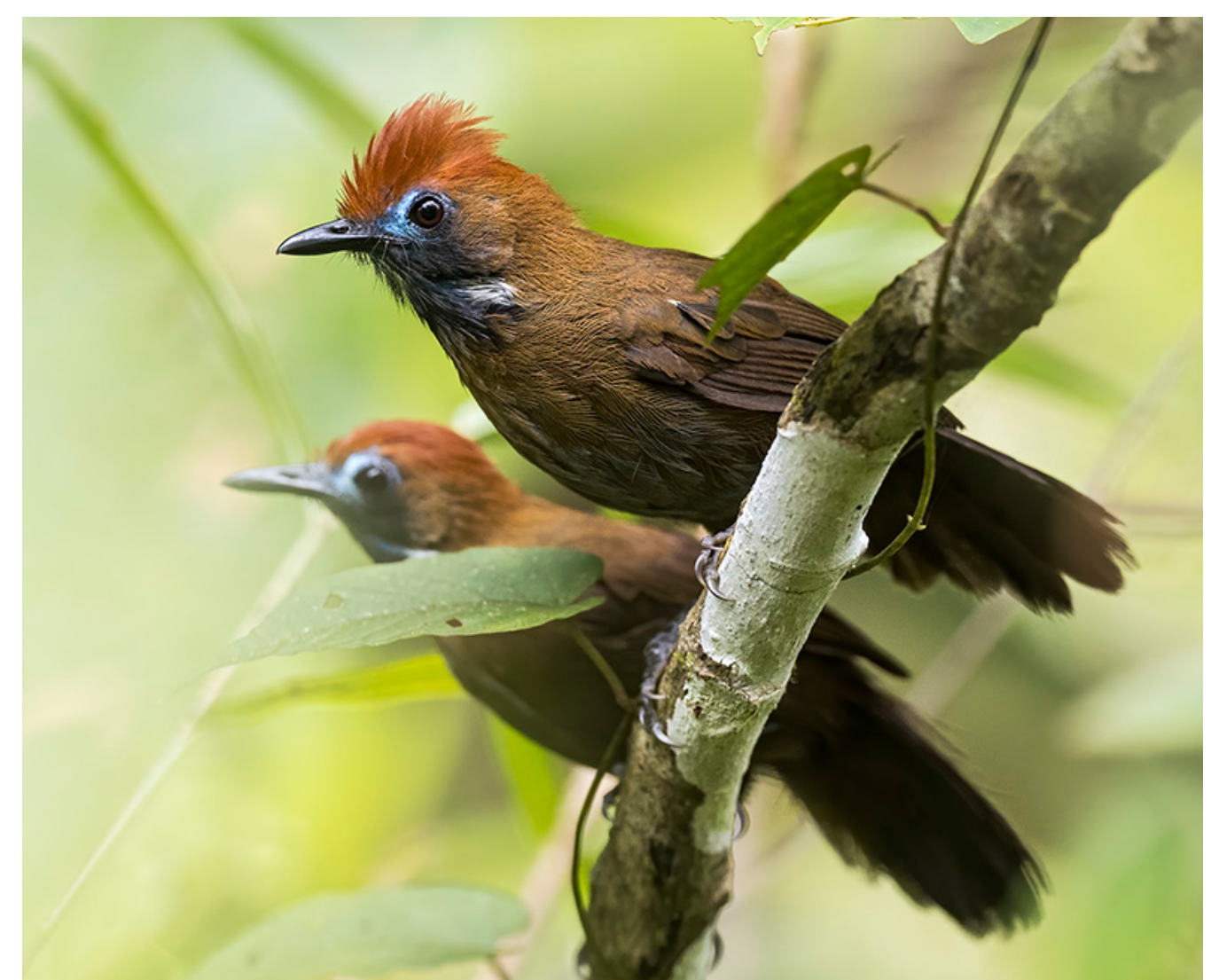
Babblers are all over the place in Sundaland! This is one of the coolest species, the Fluffy-backed Tit-Babbler.