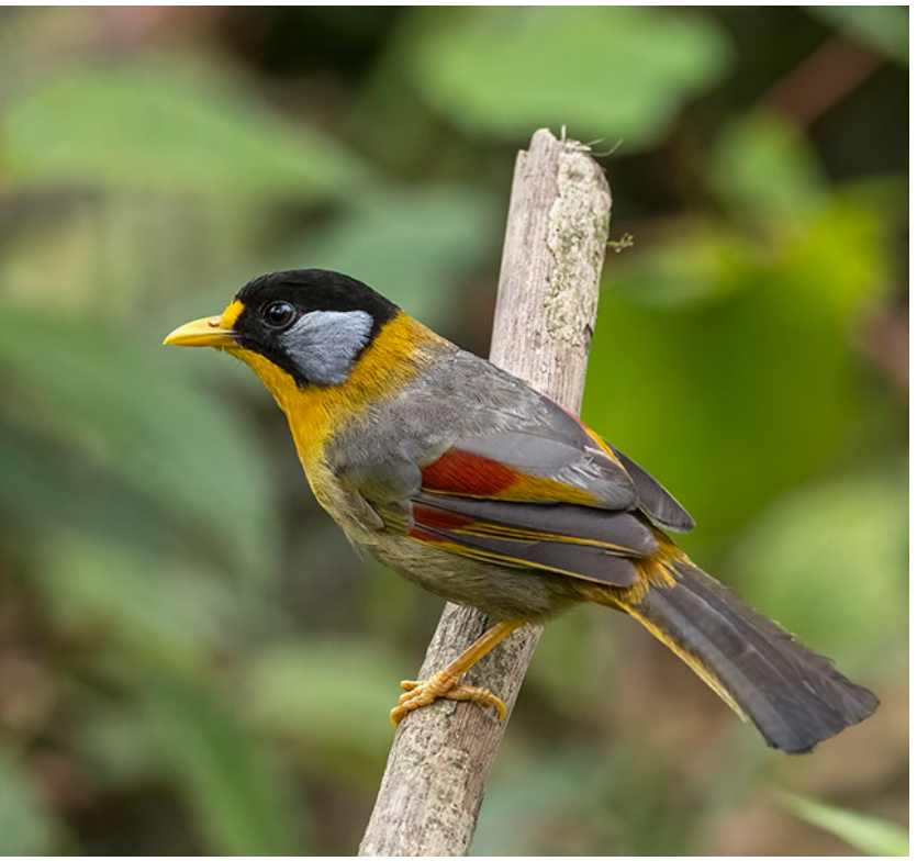
Silver-eared Mesia is a delightful visitor to feeding setups on Fraser's Hill.

After spending the night in Kuala Selangor, and waking up well before sunrise, we struck inland and uphill, heading for the former colonial hill station of Bukit Fraser, or Fraser's Hill. We had two nights and parts of three days to explore the wonders of Fraser's Hill. One of the things that make it such an attractive birding area, is that lots of habitats and birding spots can be easily accessed in a small area. The higher elevations of the hill, as around the town, have a characteristic set of highland birds, while the forest starts to change as