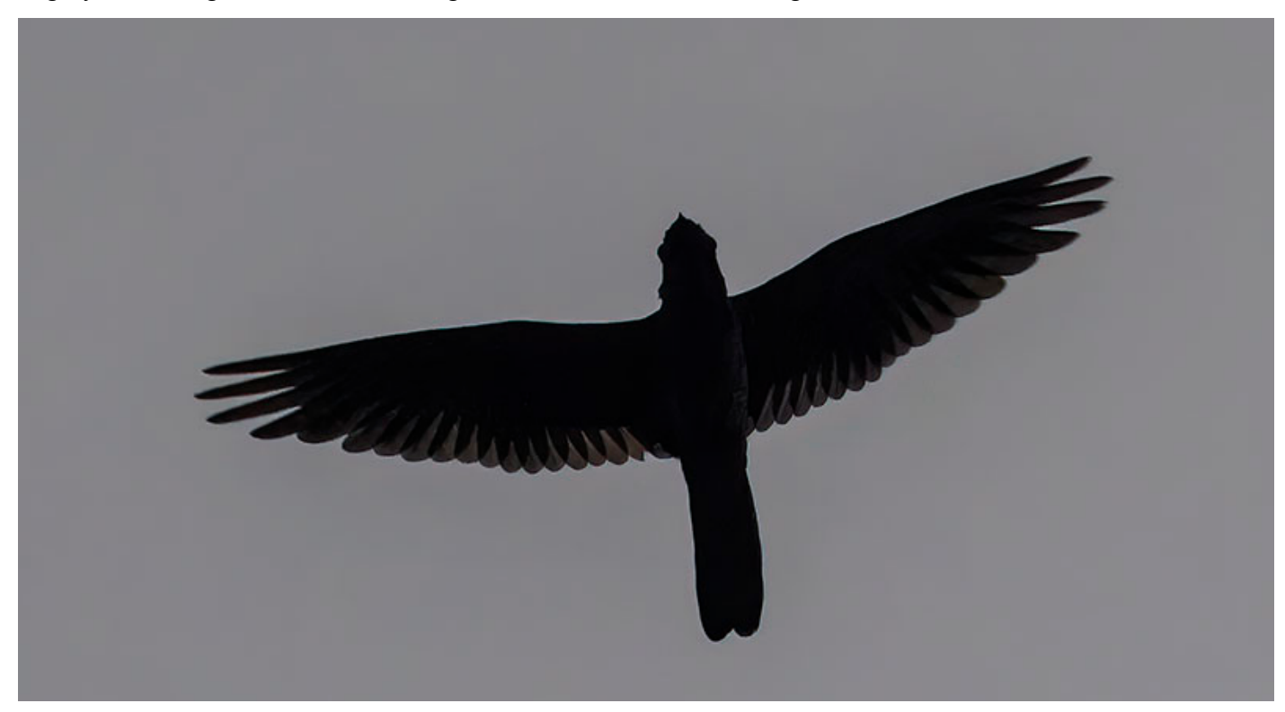
Malaysian Eared-Nightjar is big enough to easily be mistaken for a raptor!

Broadbill, Red-bearded Bee-eater, Black-thighed Falconet, and Eyebrowed Wren-Babbler. A huge fruiting tree at the Gap was dubbed the "Tree of Life". It held nearly all of the local barbets, including Yellow-crowned and Gold-whiskered Barbets, as well as the scarce Scaly-breasted Bulbul. One evening, we waited at "The Gap" until huge and raptor-like Malaysian (Eared) Nightjars emerged to start hawking insects – a memorable sight.