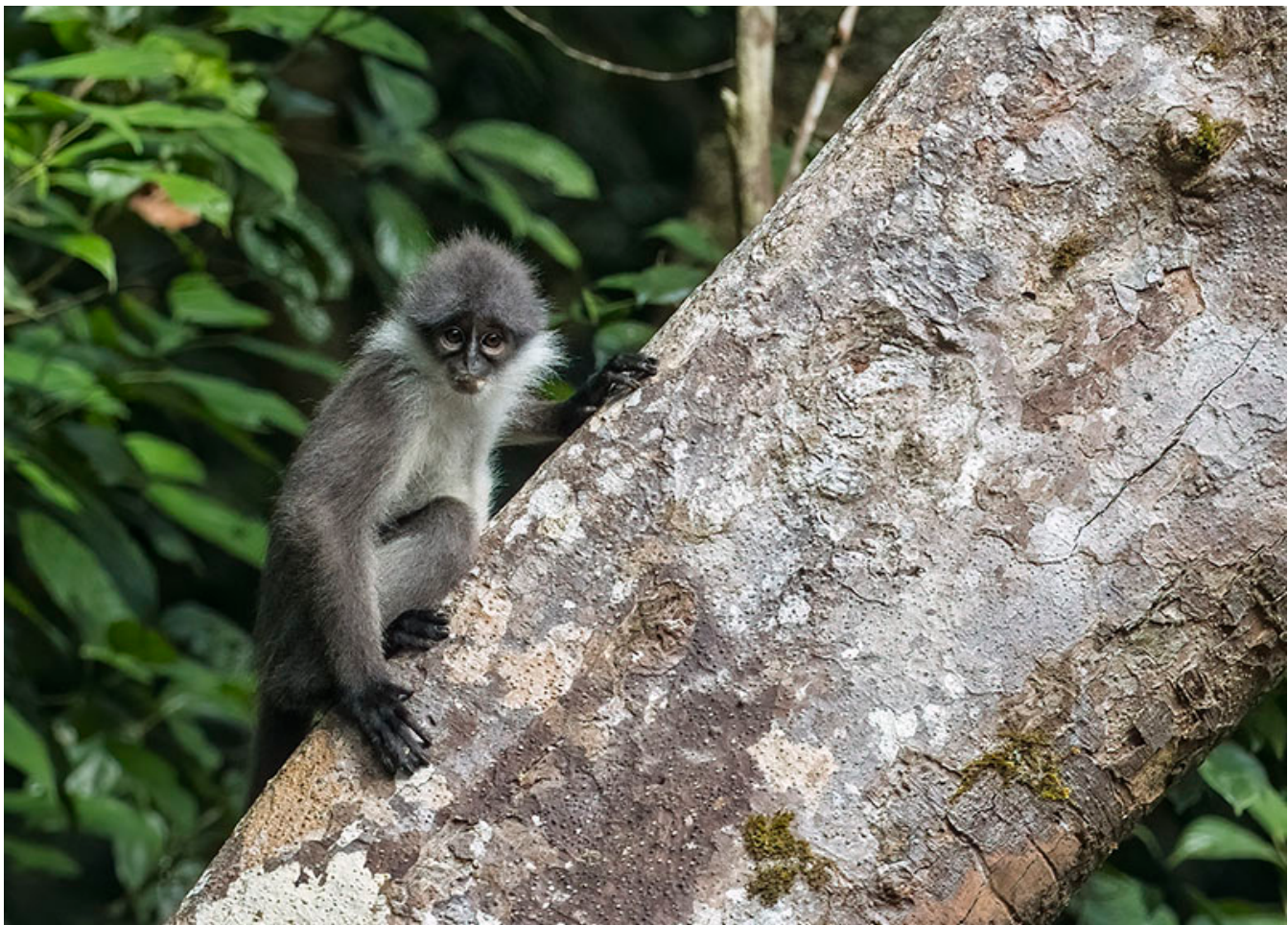
A young White-thighed Langur along the Tahan Tributary in Taman Negara.