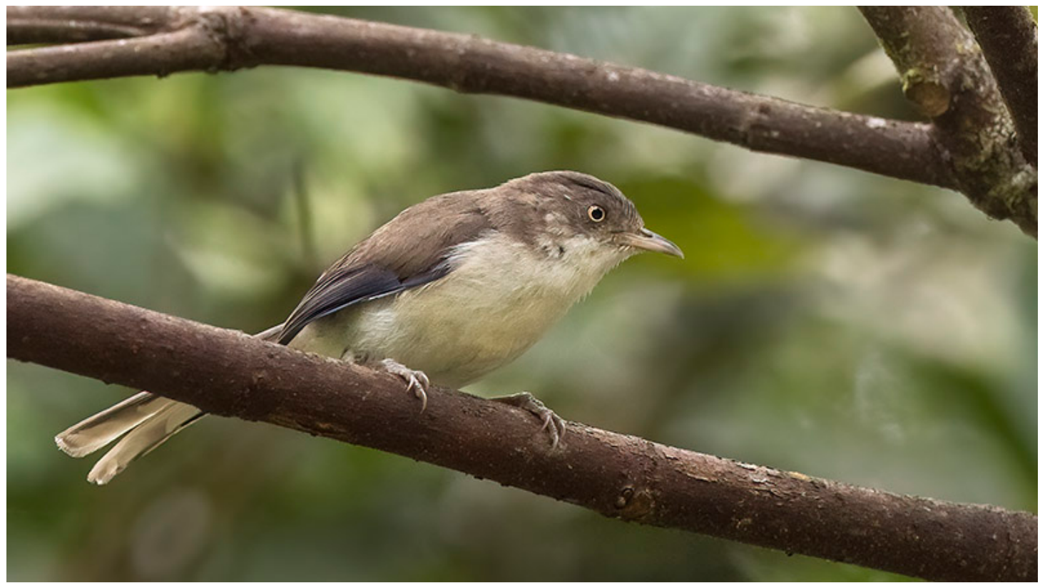
One of the birds that give Fraser's Hill a tangible Himalayan flavor is the Blue-winged Minla.