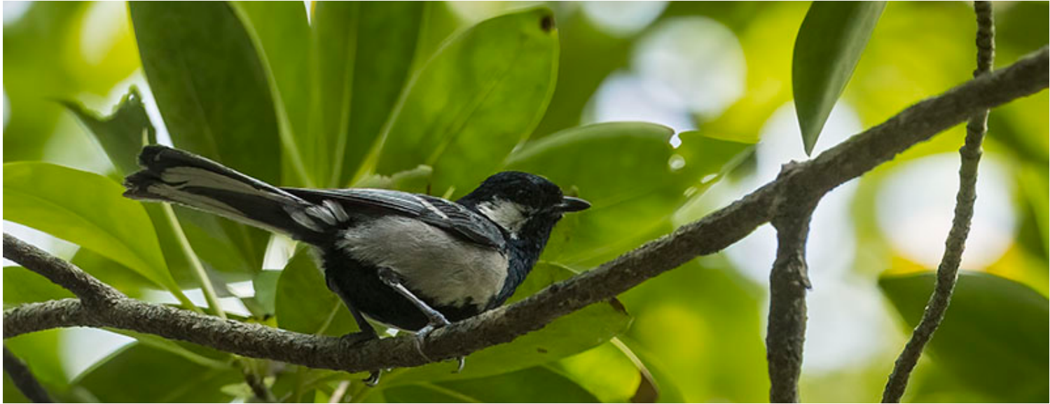
The mangrove-dwelling subspecies of Cinerous Tit seems like a potential future split.