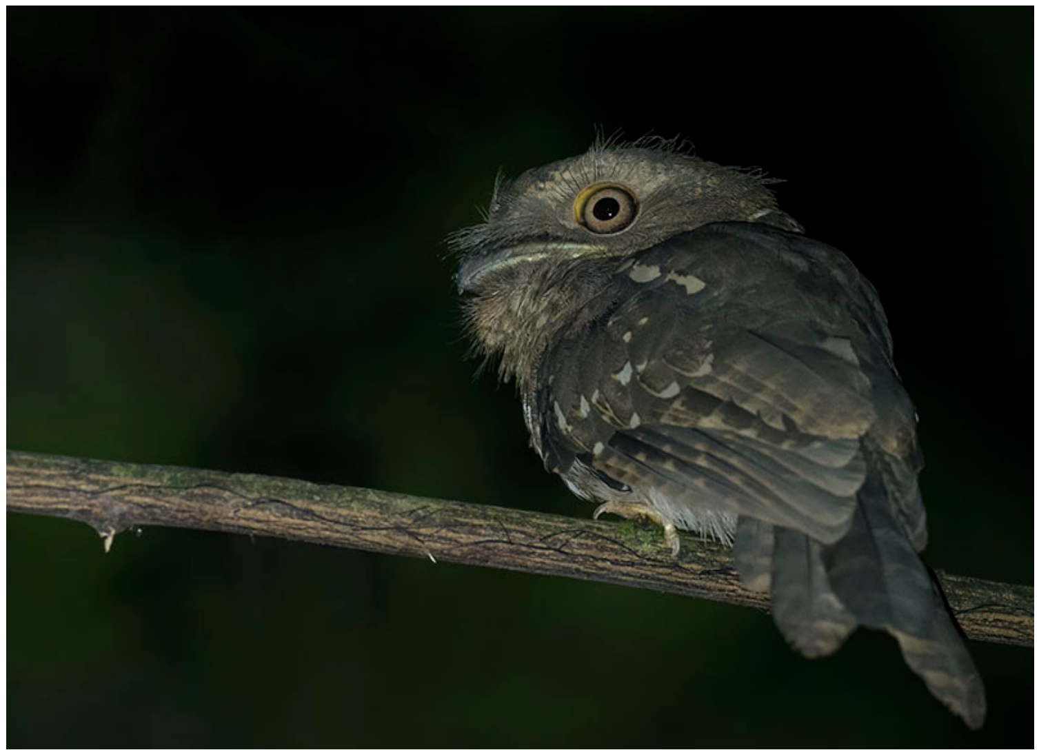
A Gould's Frogmouth pre-dawn in Taman Negara.