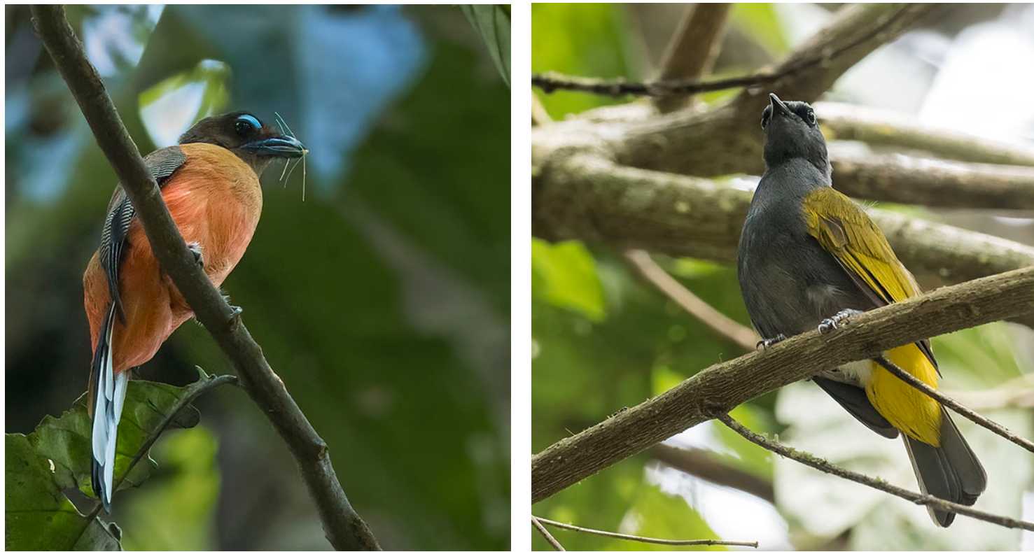
Rainforest beauties: Scarlet-rumped Trogon (left) and Gray-bellied Bulbul (right).