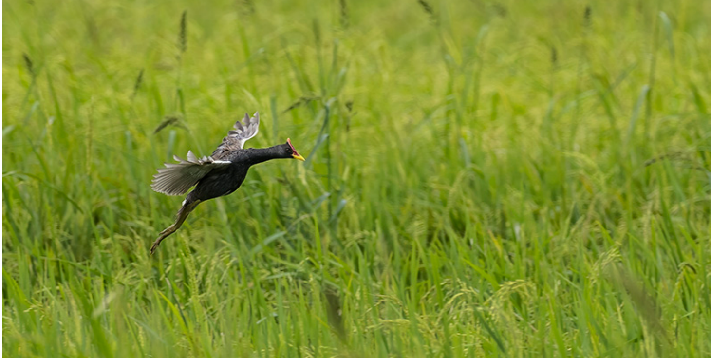
On the first day of the Panti Extension, ricefields held a bunch of new species, including Watercock.