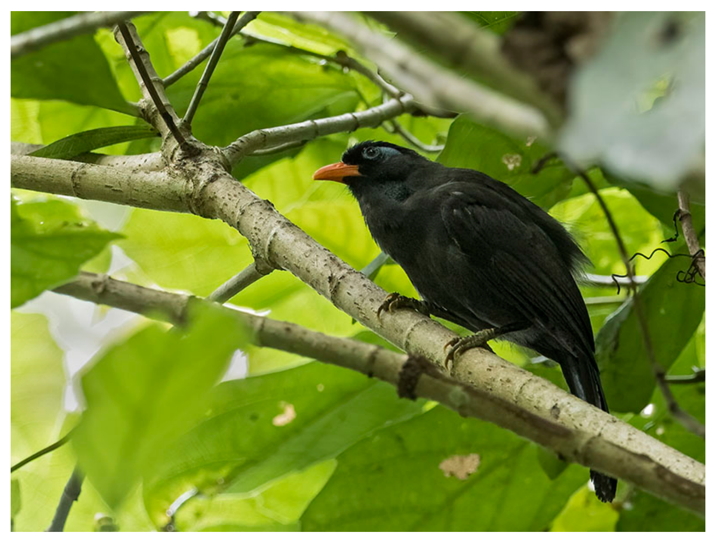
The unusual Black "Laughingthrush", which is actually a member of the babbler family, is endemic to Sumatra and Peninsular Malaysia.

but also a Sarawak pre-trip. So by the time this trip had ended, they had "cleaned up" on the vast majority of the species of Sundaland.