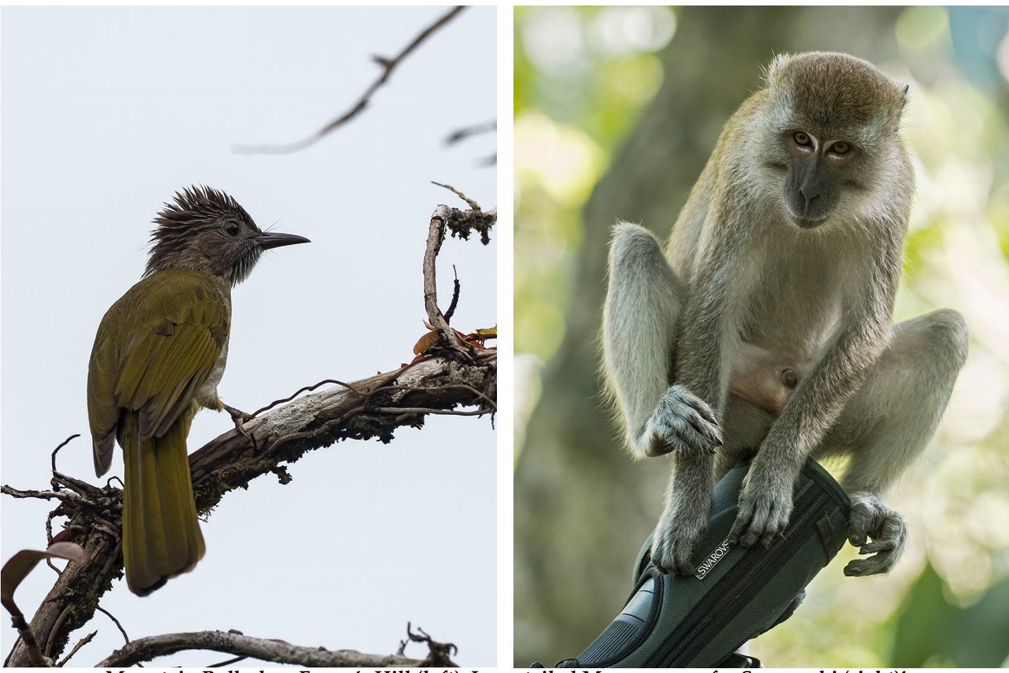
Mountain Bulbul on Fraser's Hill (left). Long-tailed Macaques prefer Swarovski (right)!