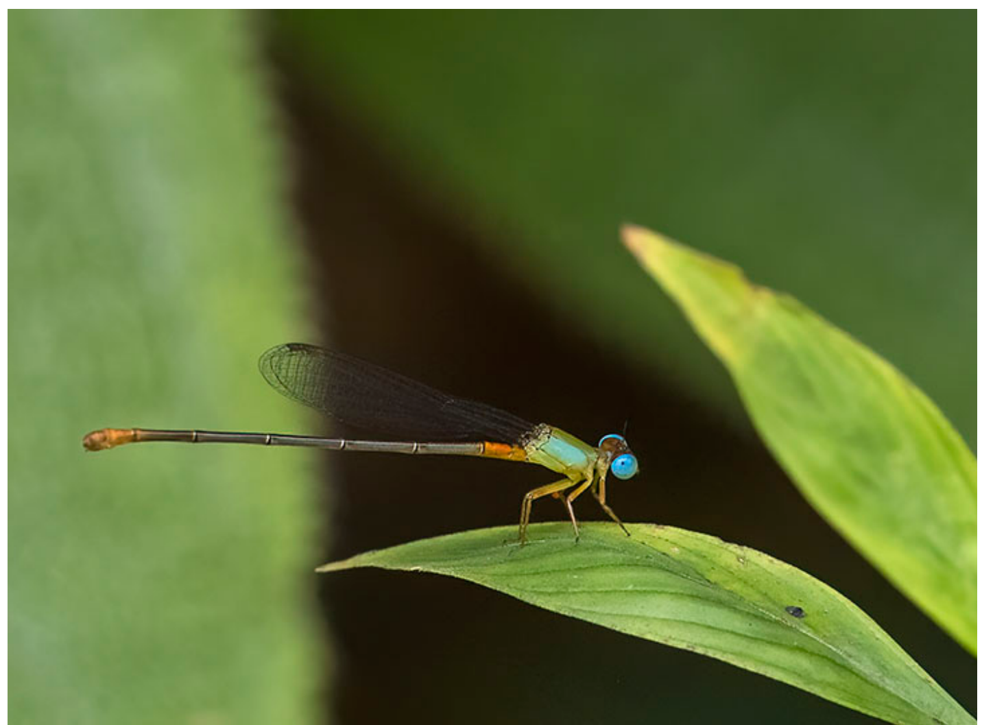
In addition to butterflies, we also recorded a good range of odonates, such as this Orange-tailed Marsh Dart.