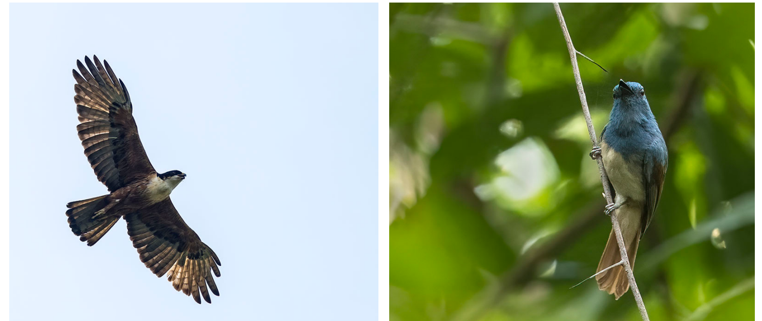
Rufous-bellied Eagle (left) and Rufous-winged Philentoma (right) in Taman Negara.