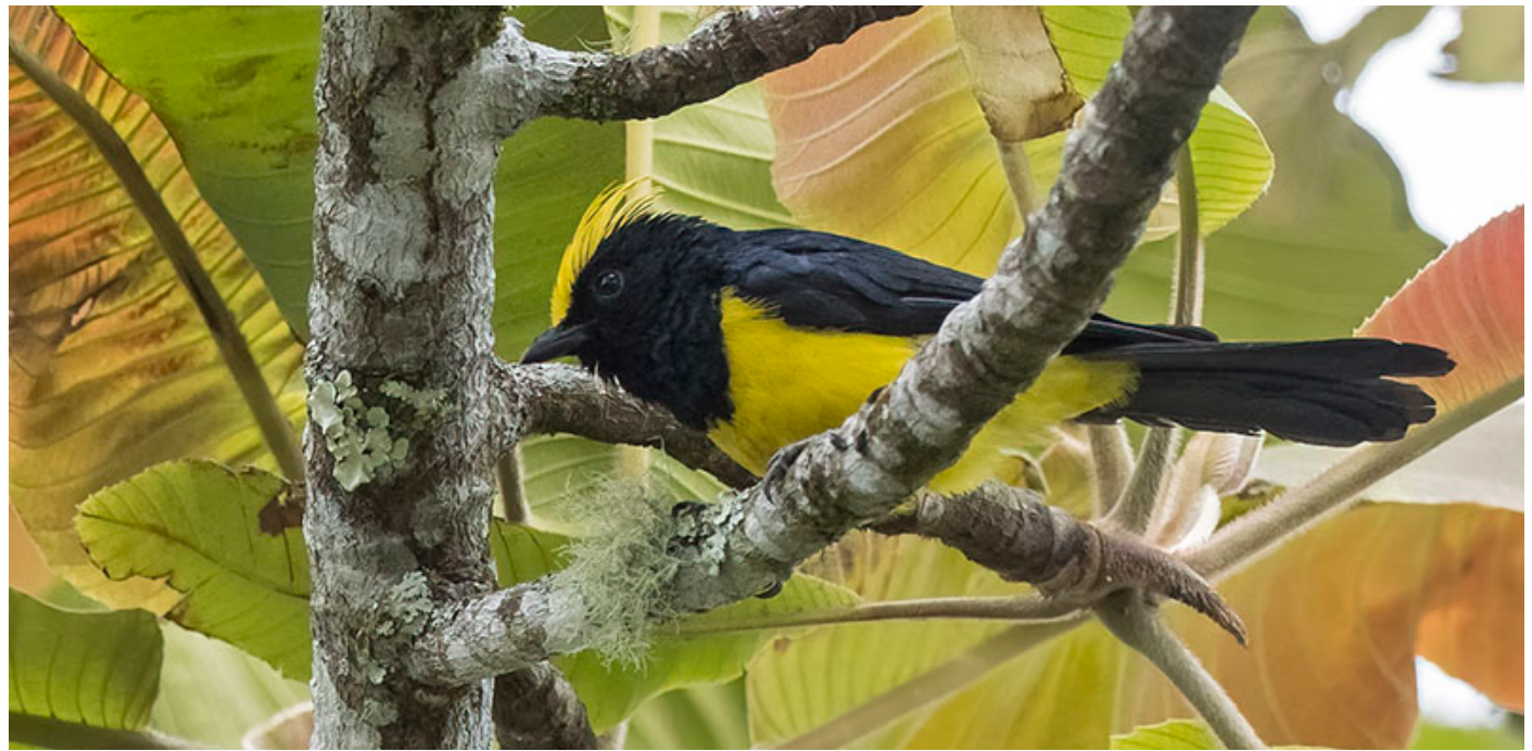
Sultan Tit is the largest "chickadee" in the world!