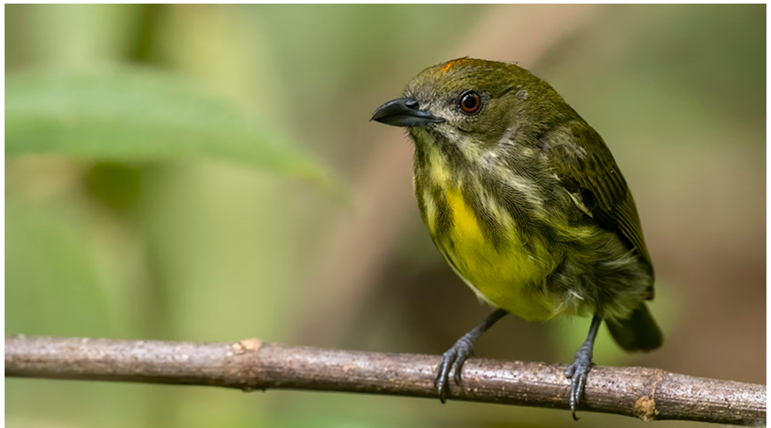
The flowerpecker family is found in Asia and Australasia. Shown here are Yellow-breasted (above) and Firebreasted (below) Flowerpeckers, at Taman Negara and Fraser's Hill respectively.