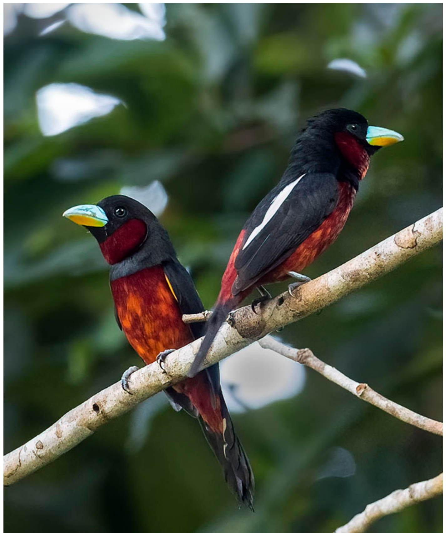
Broadbills are ridiculously cool birds, and there are a bunch on this tour, including Black-and-red.