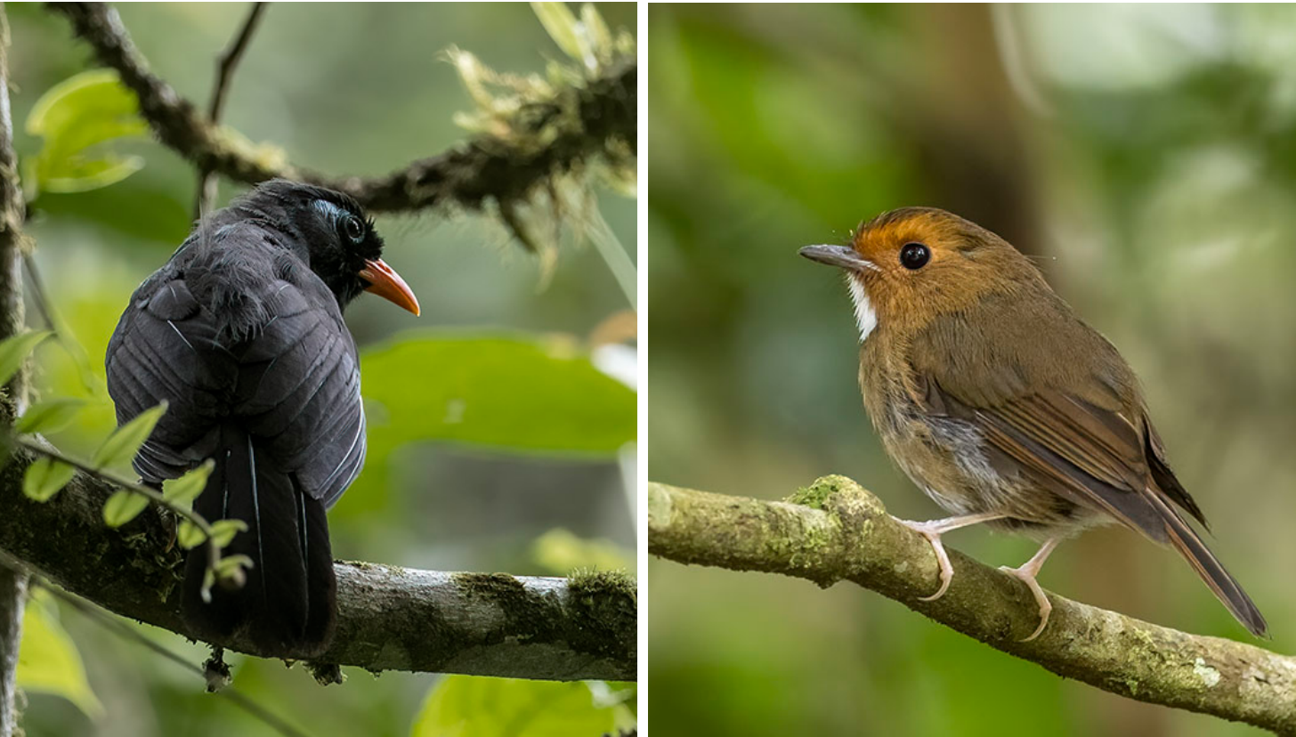
Black Laughingthrush (left) and Rufous-browed Flycatcher. Both on Fraser's Hill.