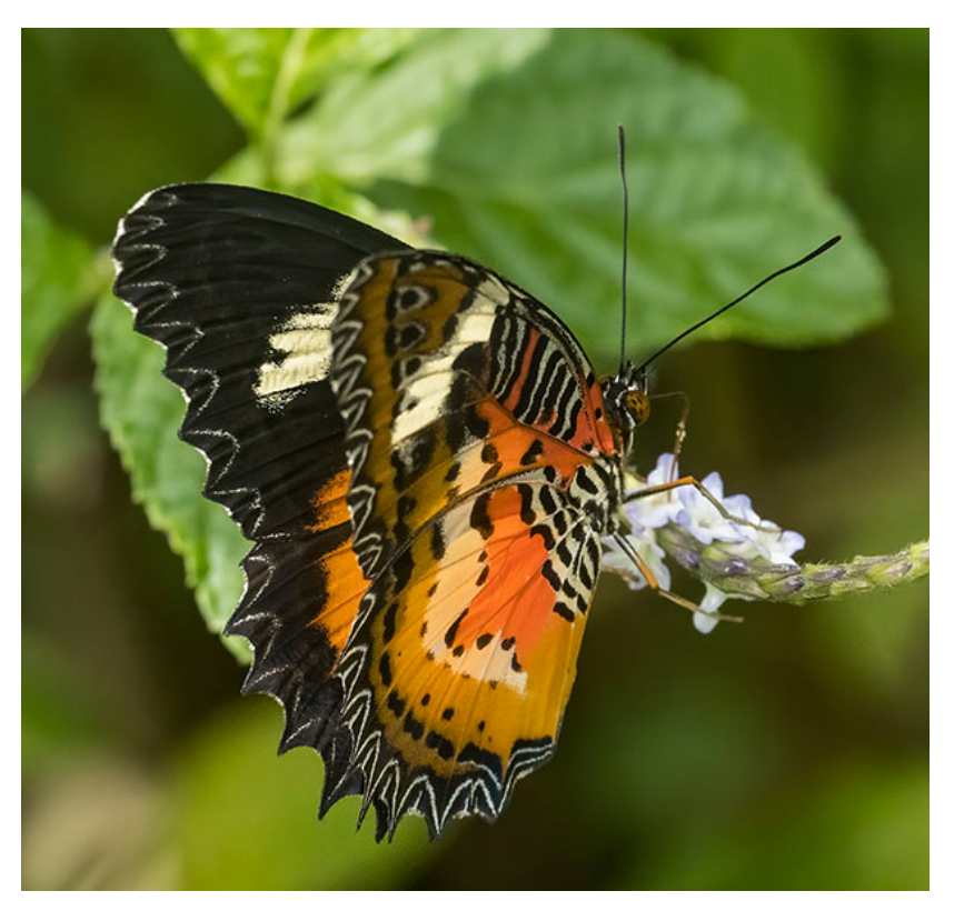
One of 65 butterflies that we recorded, this one a Malayan Lacewing in Panti Forest.

Between the Sarawak pre-trip, the Borneo main trip, the Asia Introtour, and the final Panti Extension, Ken had spent nearly a month guiding and birding in Sundaland. Lots of tough work without a doubt, but dozens of magical and memorable encounters with some of the world's coolest wildlife to make it well worthwhile.