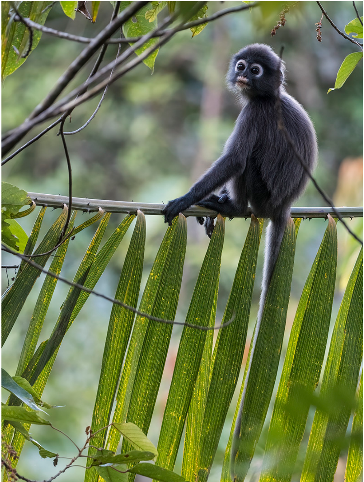
The Dusky Langur made it onto our top 5 trip highlights. We saw these beautiful monkeys on Bukit Fraser and Bukit Tingii.