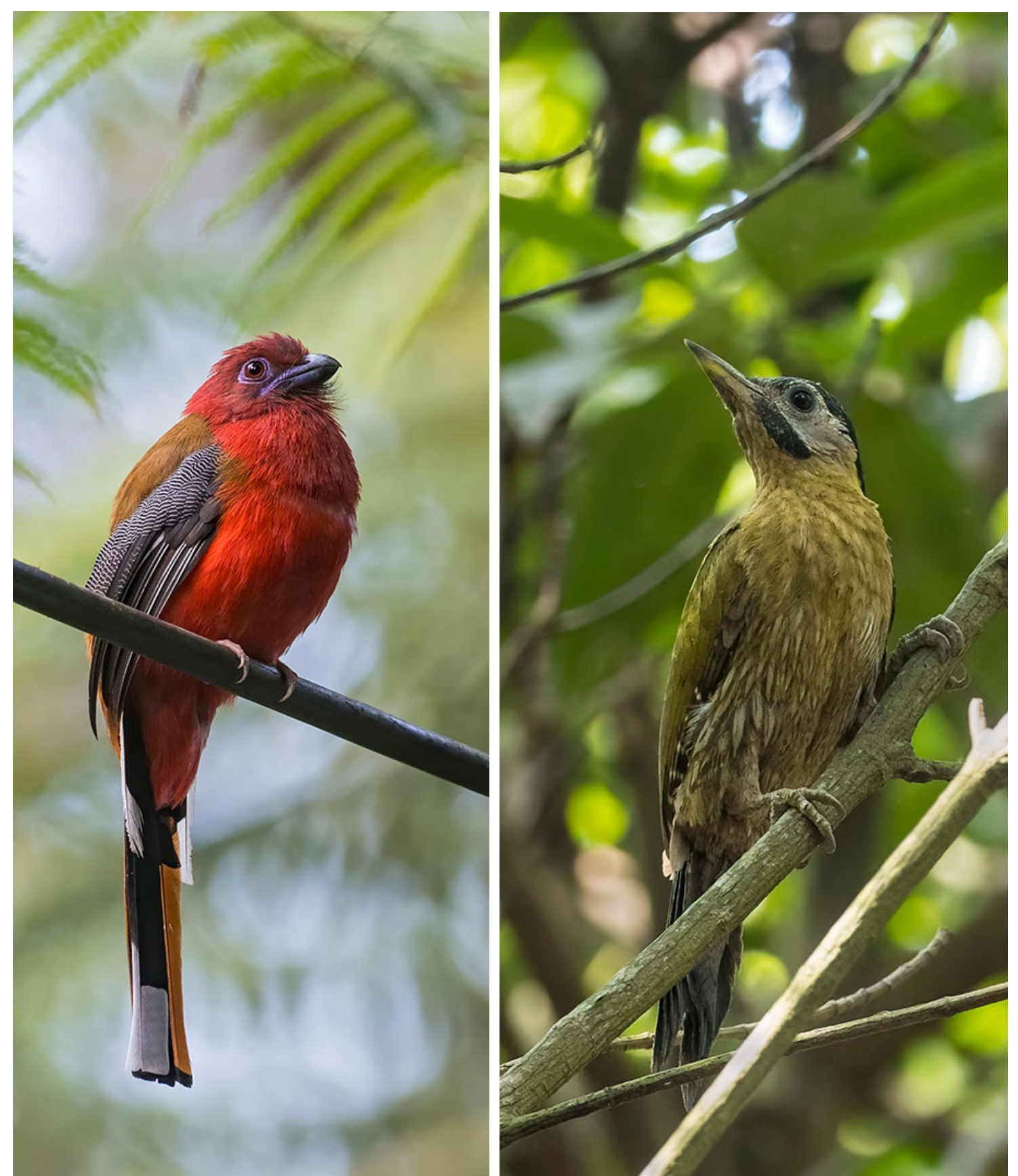
Red-headed Trogon on Fraser's Hill (left); Laced Woodpecker in Kuala Selangor (right).